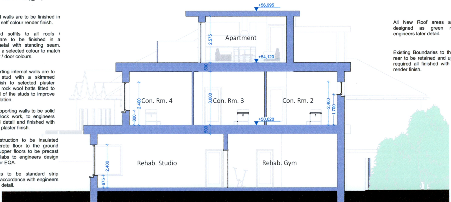
Proposed Section A-A

Existing Boundaries to the side and rear to be retained and upgraded as required all finished with a selected render finish.