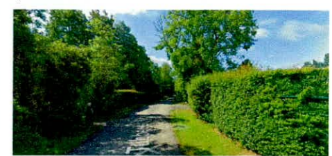
P2 POSITION 02