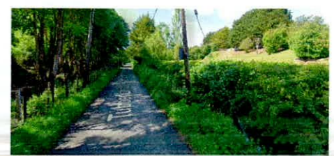
P4 POSITION 04