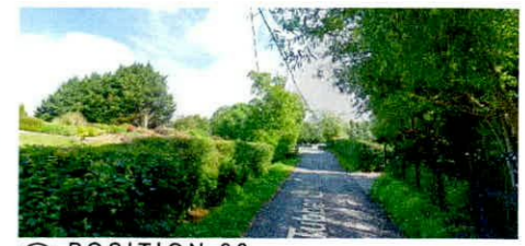
P3 POSITION 03