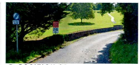
P1 POSITION 01