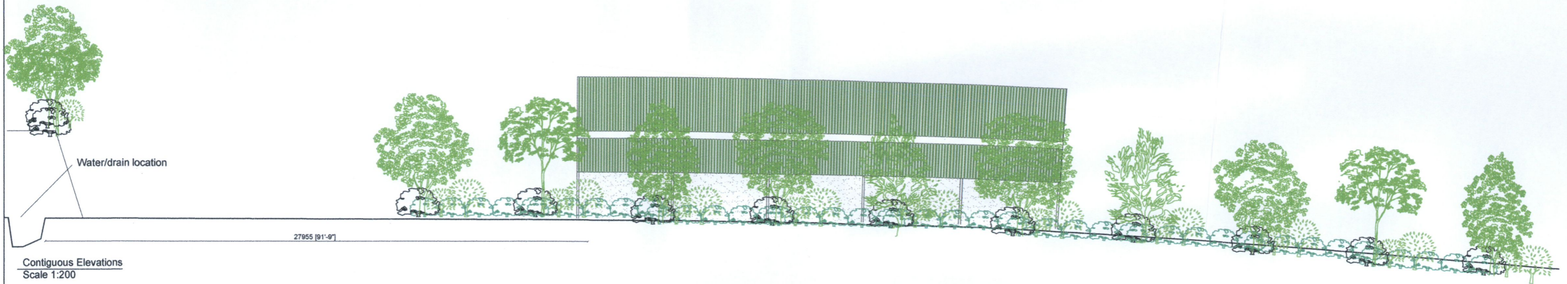
Contiguous Elevations Scale 1:200