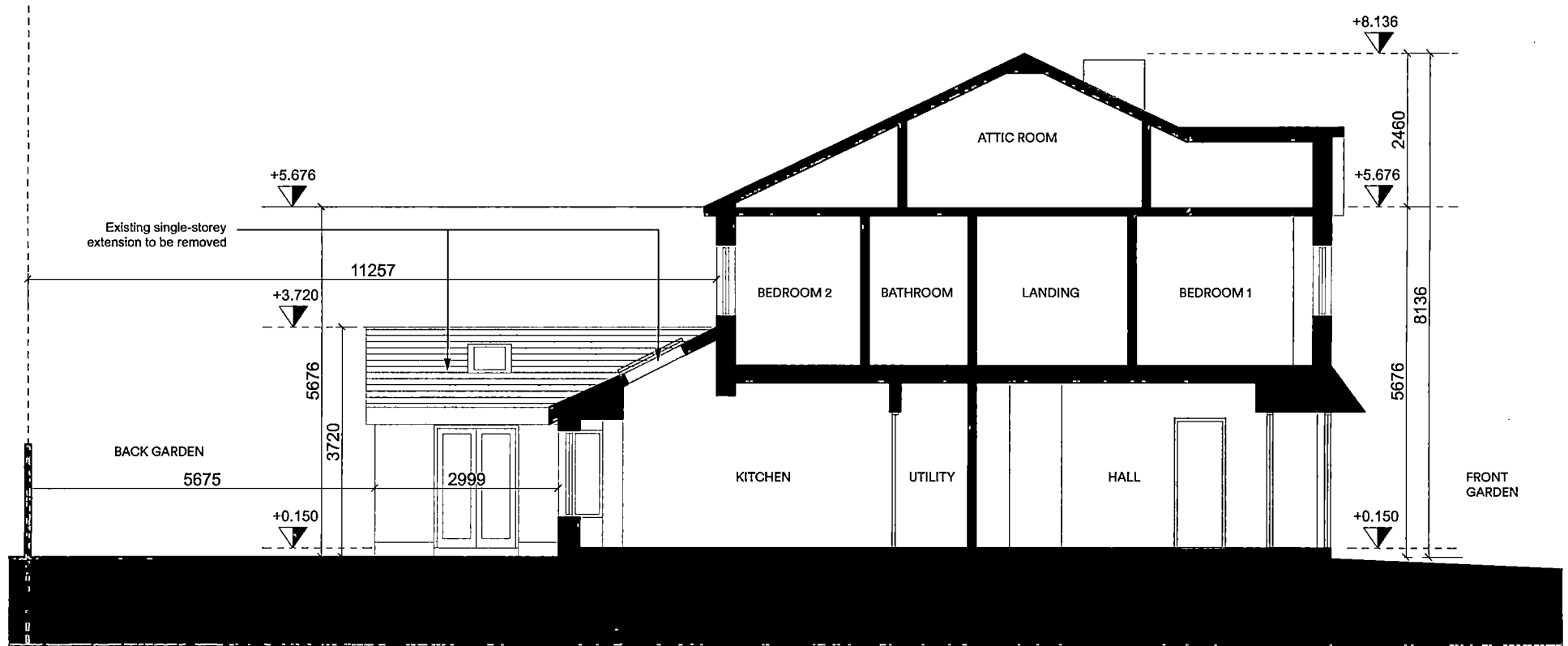
EXISTING SECTION A-A 1:100