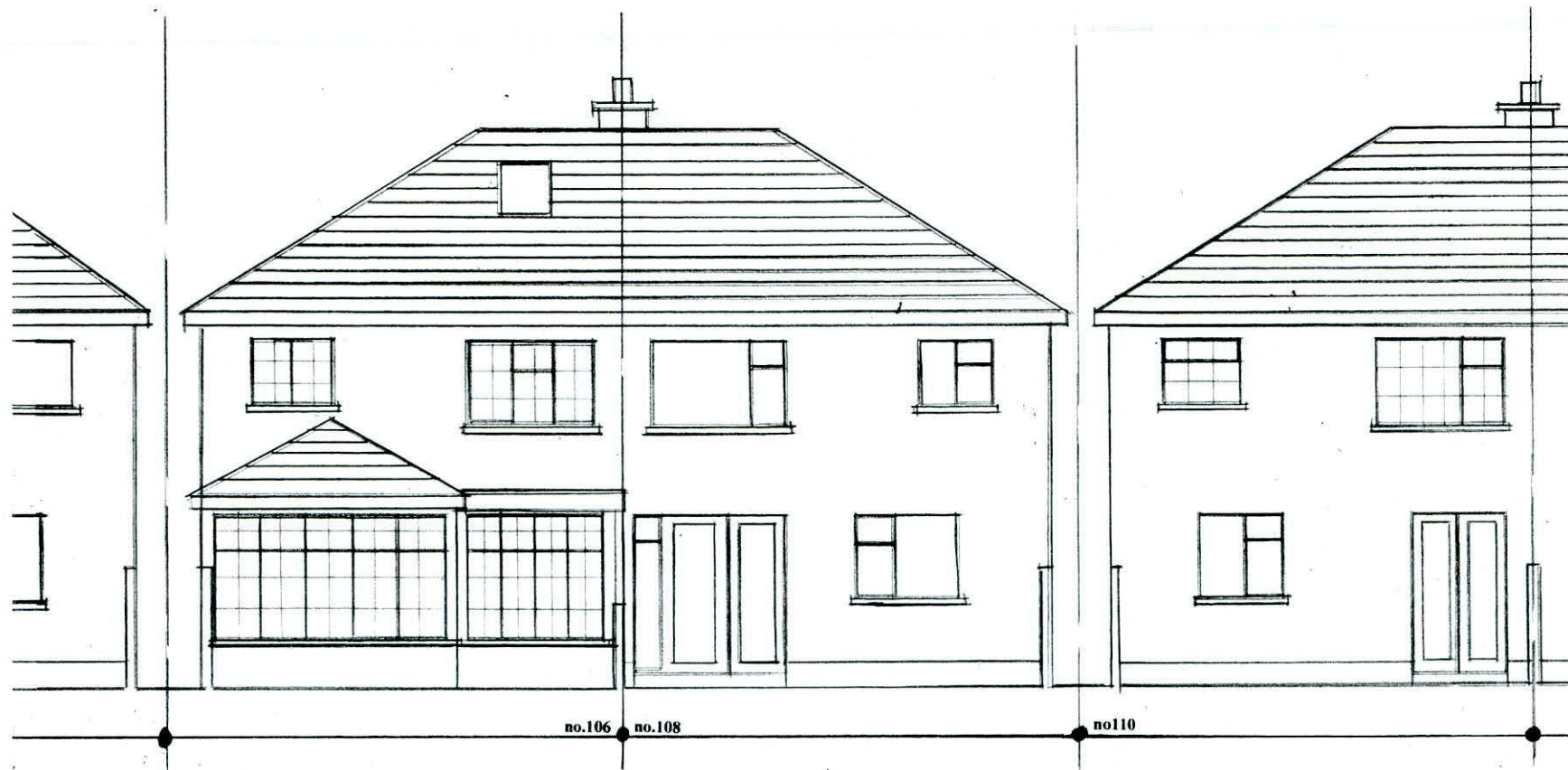
Existing Rear Block Elevation scale 1:100