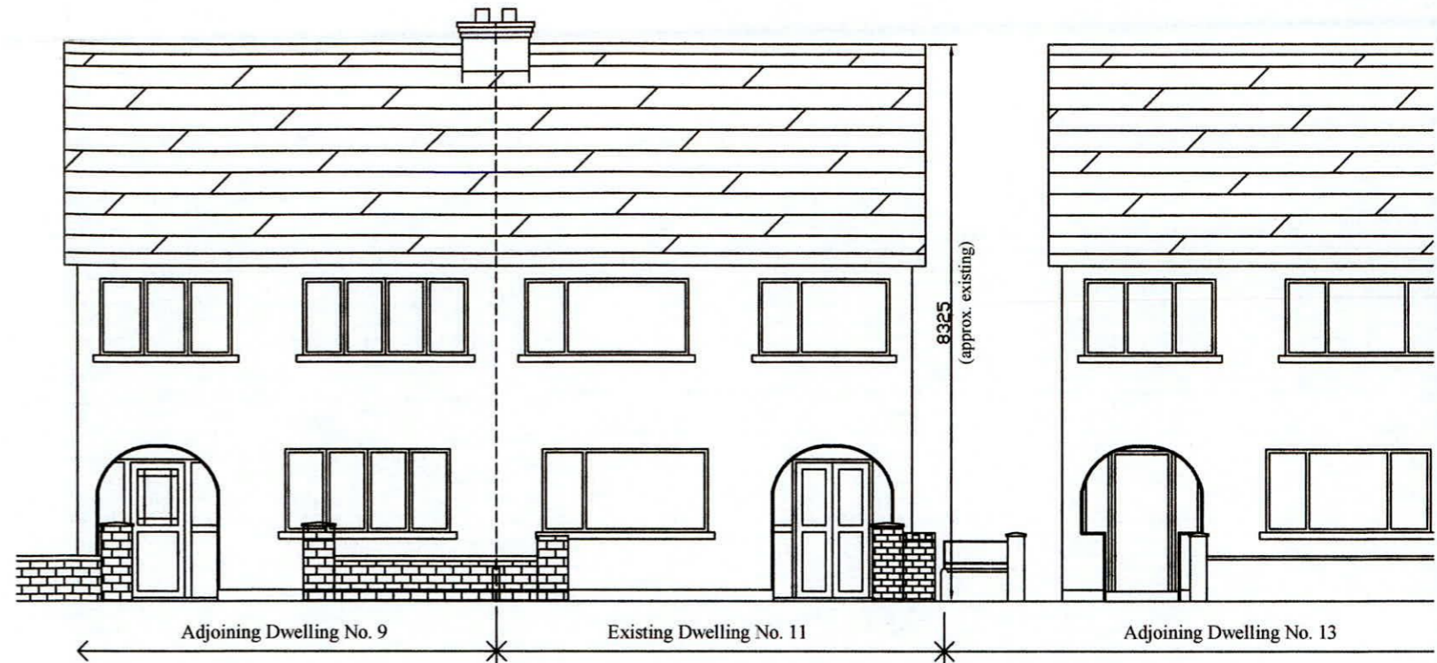
ELEVATION TO ROADWAY WITH DWELLING SHOWN