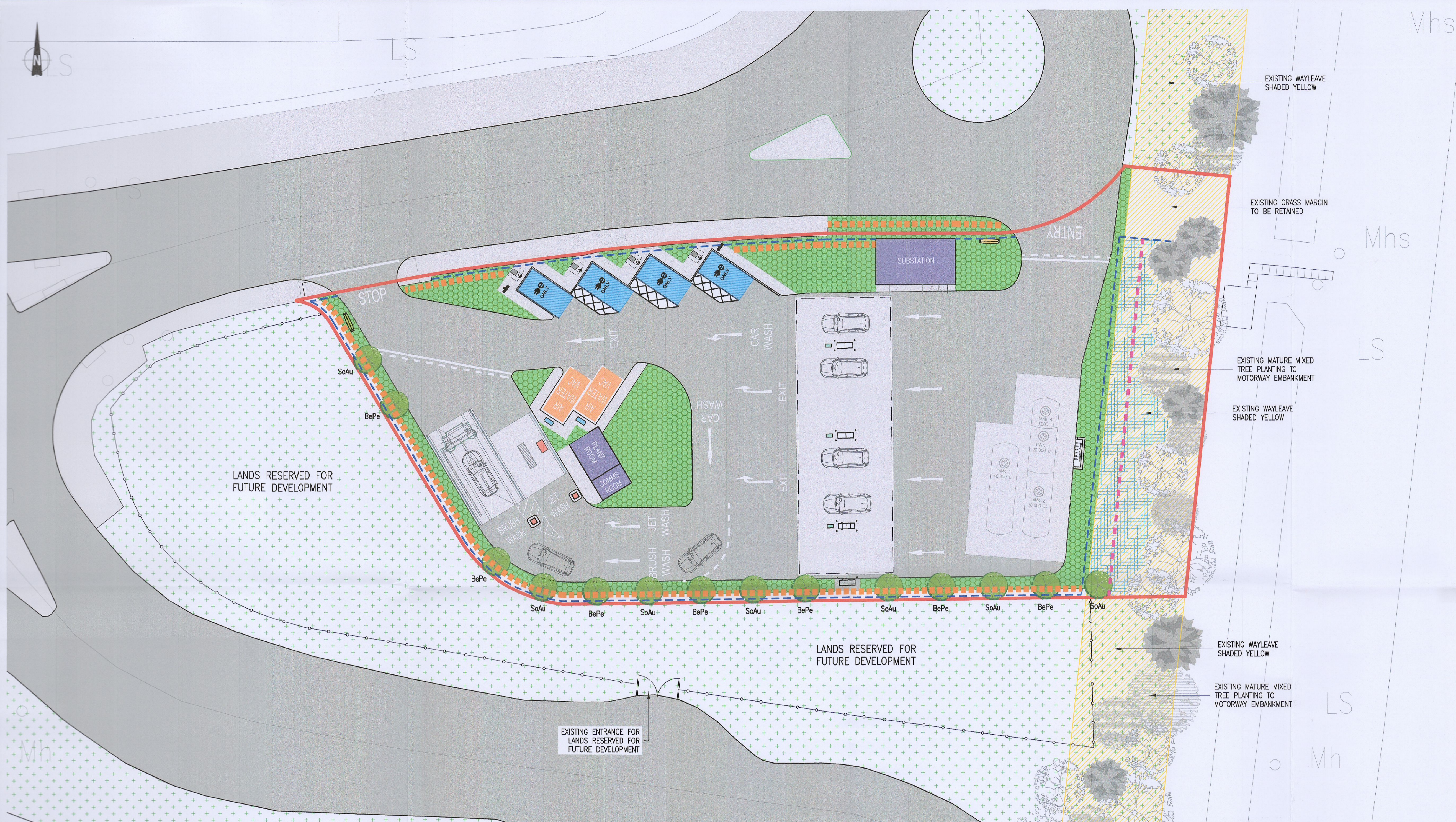
PROPOSED LANDSCAPING LAYOUT SCALE - 1:200

LEGEND: — PROPOSED SITE BOUNDARY AREA = 2680m 2