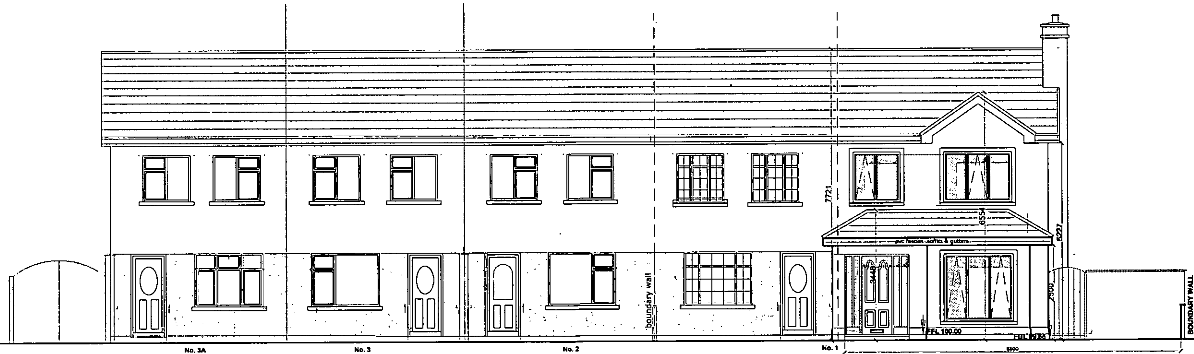
PROPOSED CONTIGUOUS FRONT ELEVATION