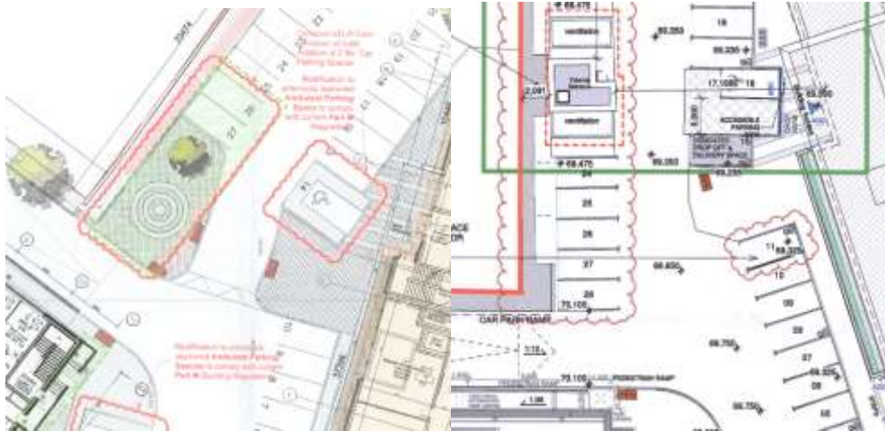
Permitted Layout (Left) and Proposed Layout (Right)

It is considered (as detailed under 'car parking' below) that the development can withstand the loss of car parking spaces that would be associated with retaining the permitted pedestrian crossings and landscaped area layout at the corner. This can be done by condition , but as there is another issue with the proposed development, it should be resolved as part of the request for additional information .