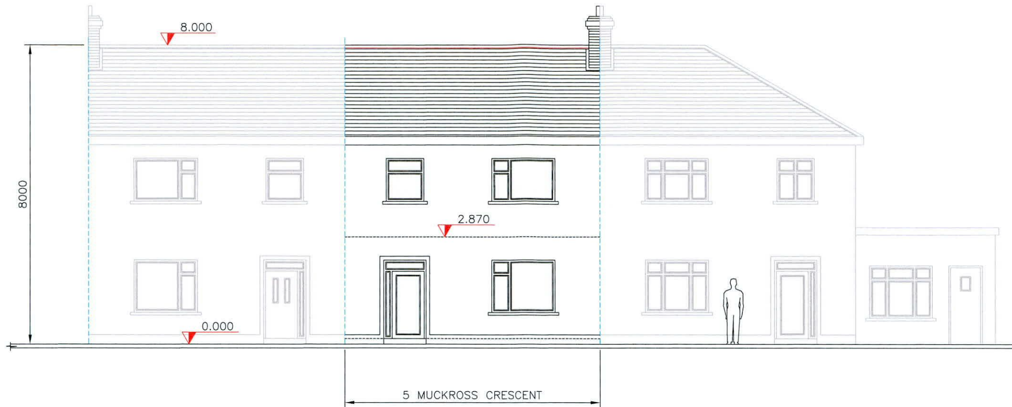
EXISTING FRONT ELEVATION - CONTIGUOUS