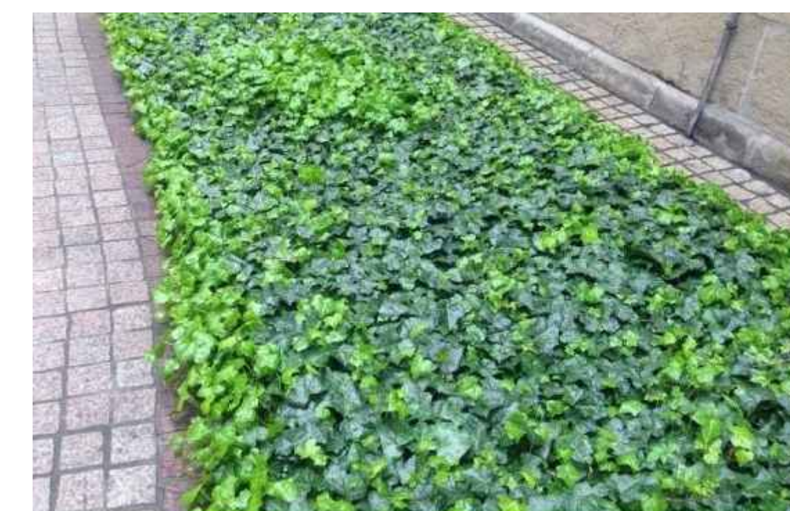
Hedera helix 'Hibernica' 6/m 2