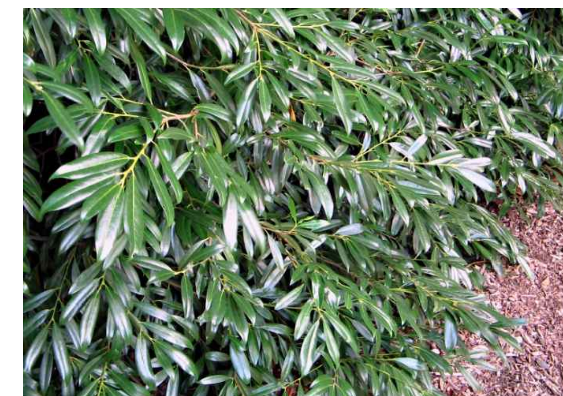
Prunus laurocerasus 'Zabeliana'