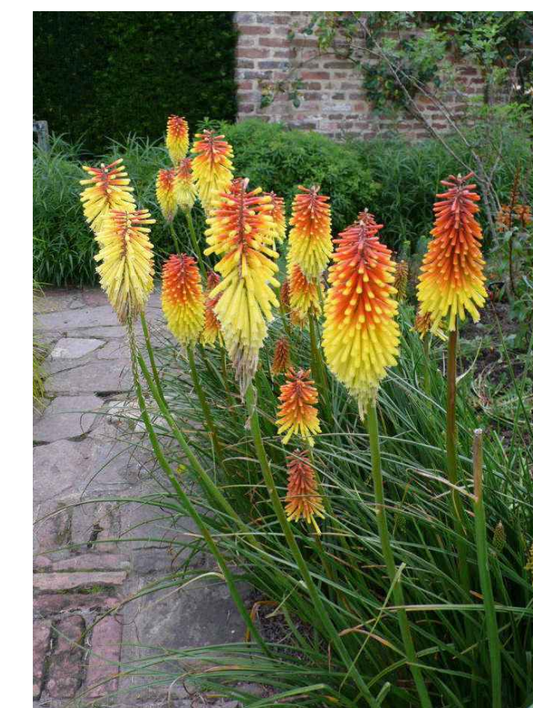
Kniphofia 'Royal standard' 2L