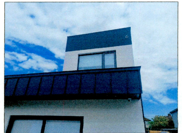
EXTERNAL VIEW - SHOWING OBSCURE GLASS PREVENTING ANY OVERLOOKING