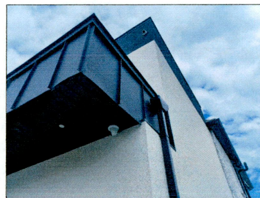
REAR VIEW - GROUND & PART FIRST FLOOR EXTENSION