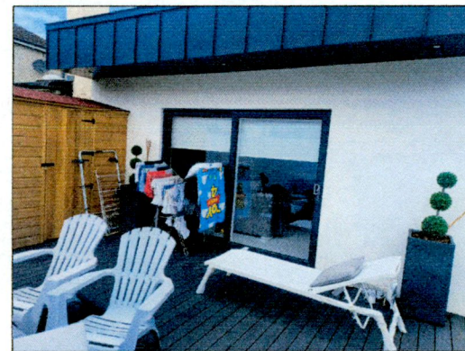
REAR VIEW - GROUND FLOOR EXTENSION