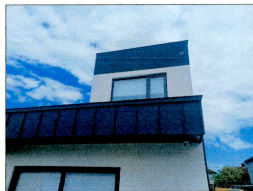
REAR VIEW - GROUND & PART FIRST FLOOR EXTENSION WITH CANOPY AT GROUND FLOOR LEVEL AND OBSCURE GLASS TO FIRST FLOOR BEDROOM