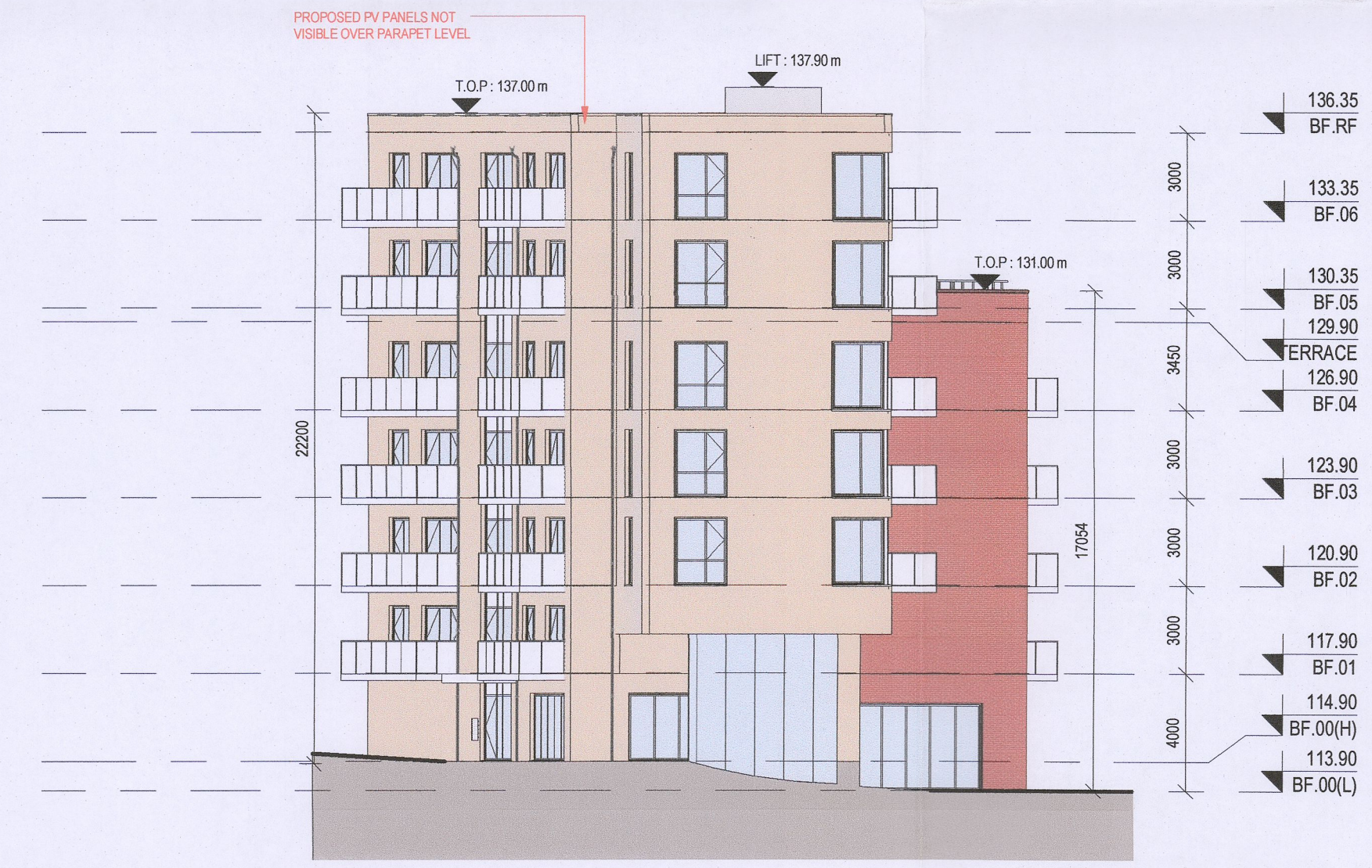
4 PROPOSED - BLOCK F - EAST ELEVATION Scale: 1 : 200