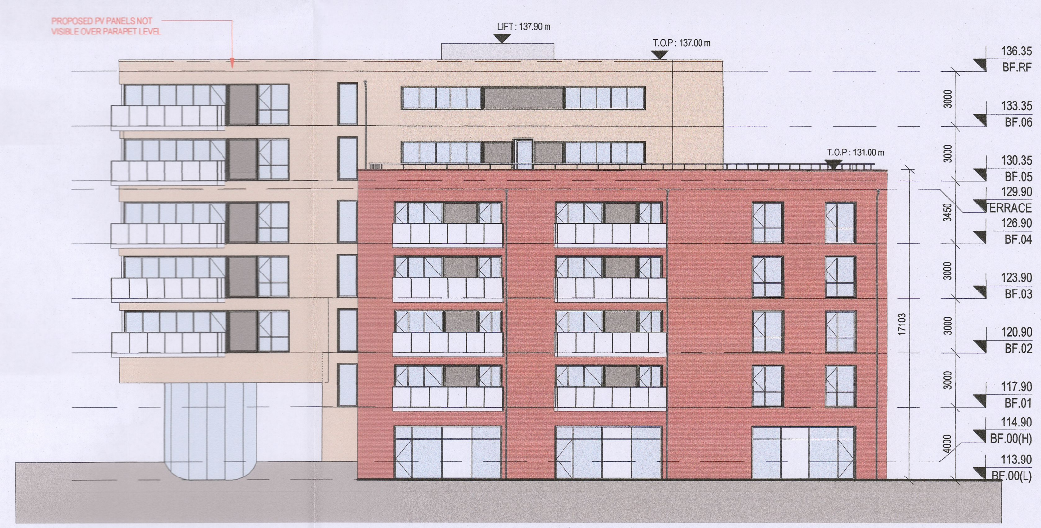
3 PROPOSED - BLOCK F - NORTH ELEVATION Scale: 1 : 200