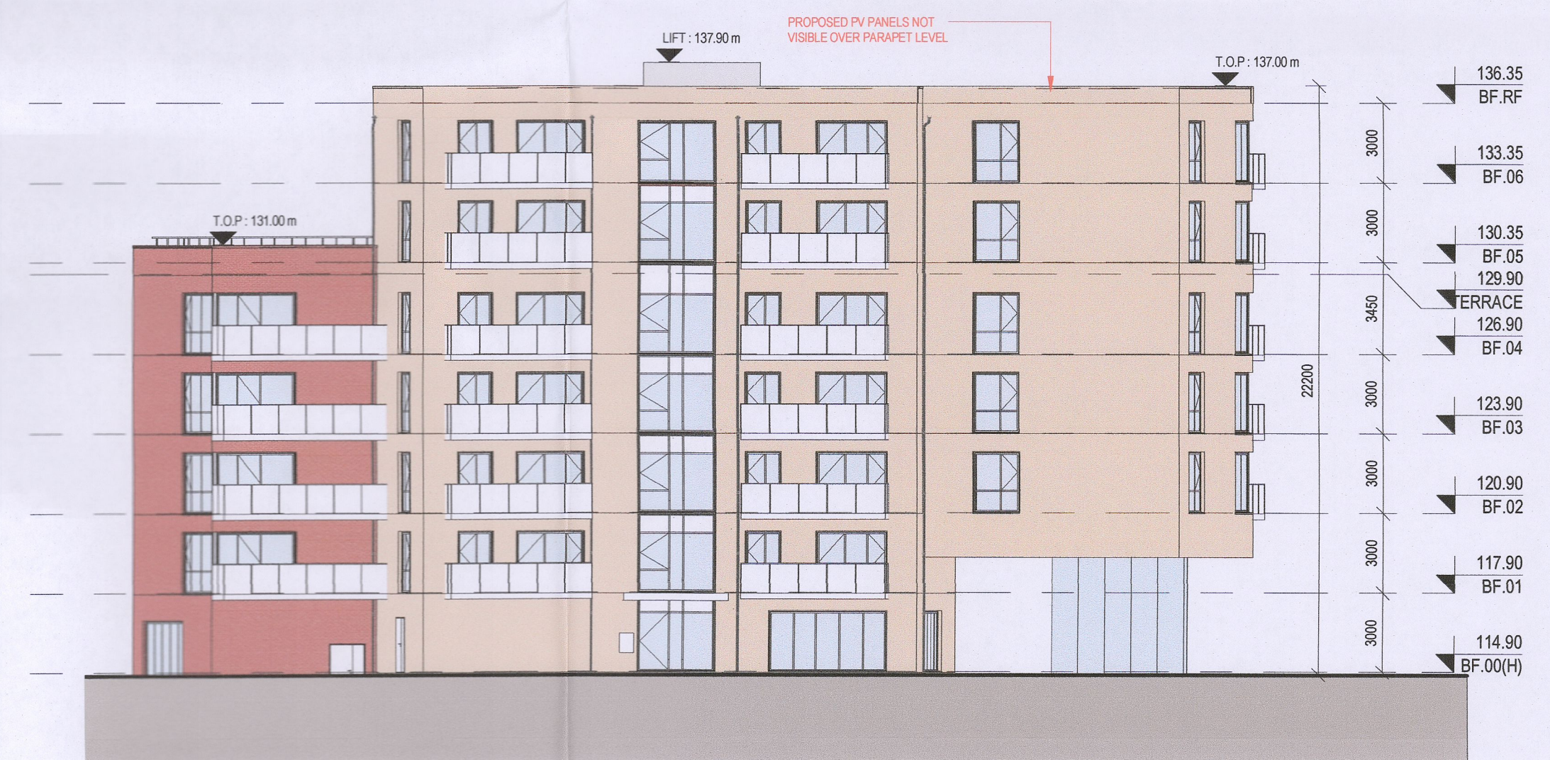
3 PROPOSED - BLOCK F - SOUTH ELEVATION Scale: 1 : 200