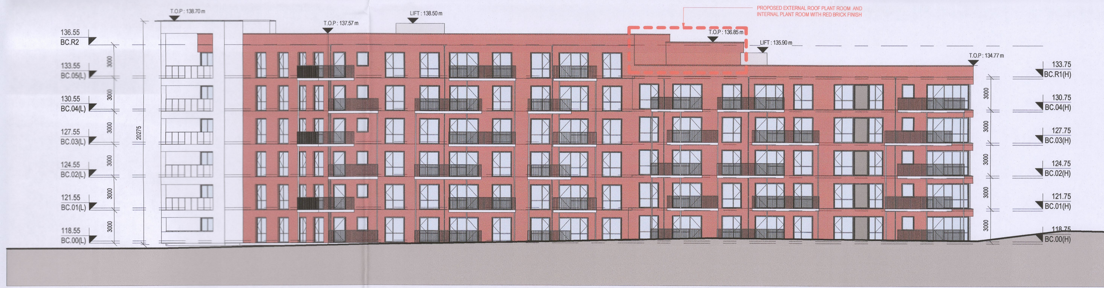
3 PROPOSED - BLOCK C - WEST ELEVATION Scale: 1 : 200