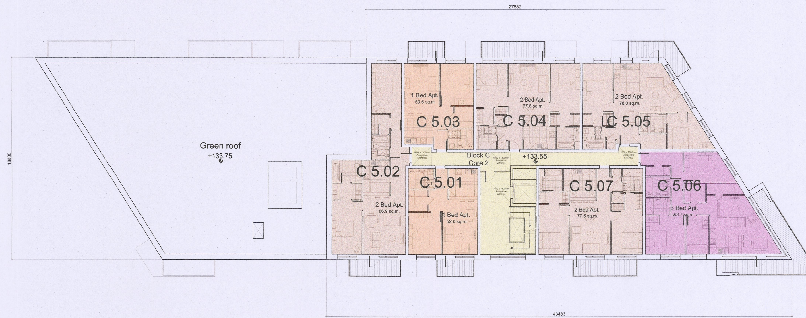
1 BLOCK C - PERMITTED FIFTH FLOOR PLAN PLANNING REF ABP-305556-19 Scale: 1 : 200