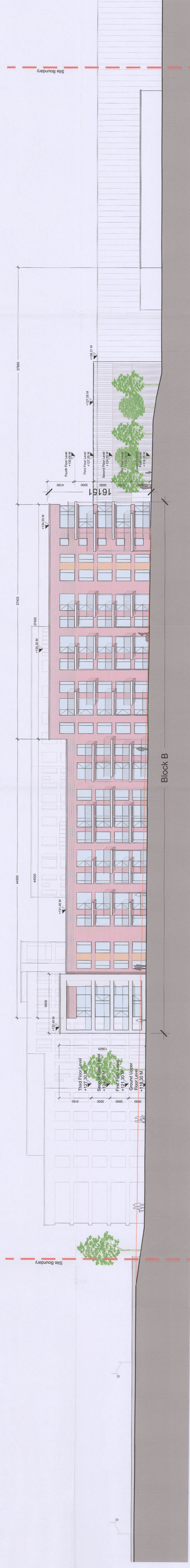
3 PERMITTED CONTIGUOUS ELEVATION - SOUTH - PLANNING REF ABP-305556-19 Scale: 1:250