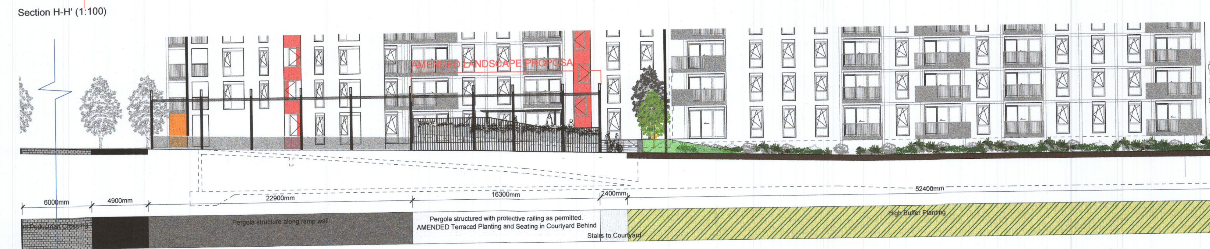
Eastern Elevation (1:200)