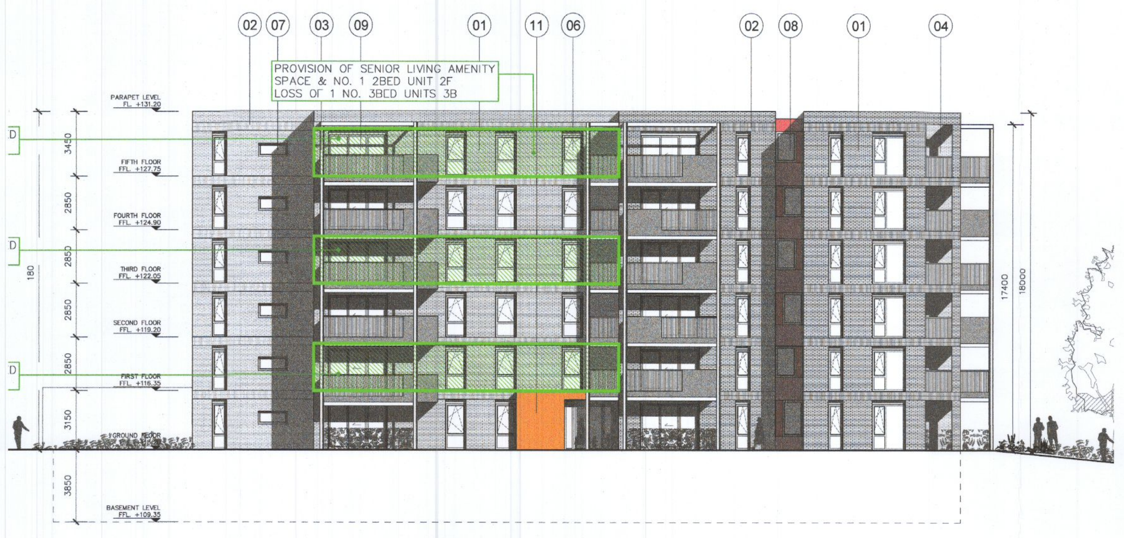
04 North Elevation C-EX-300 1:200