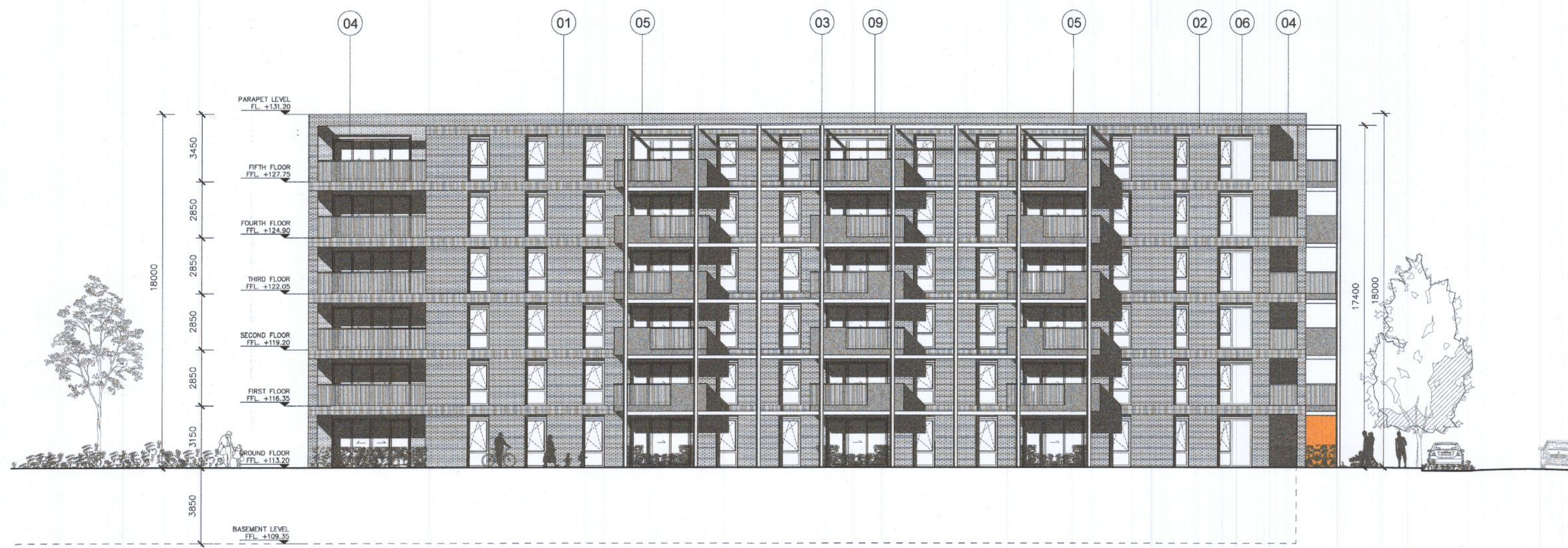
01 West Elevation C-EX-300 1:200