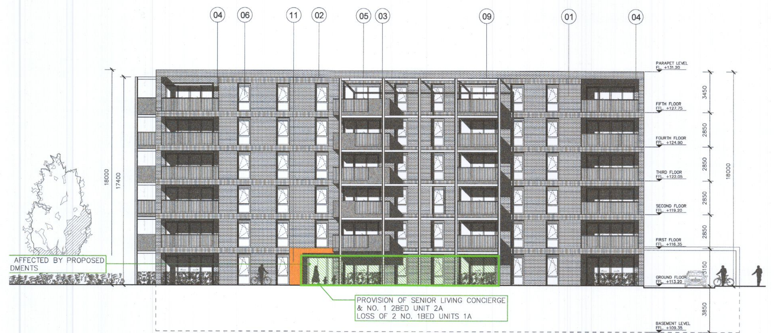
02 South Elevation C-EX-300 1:200