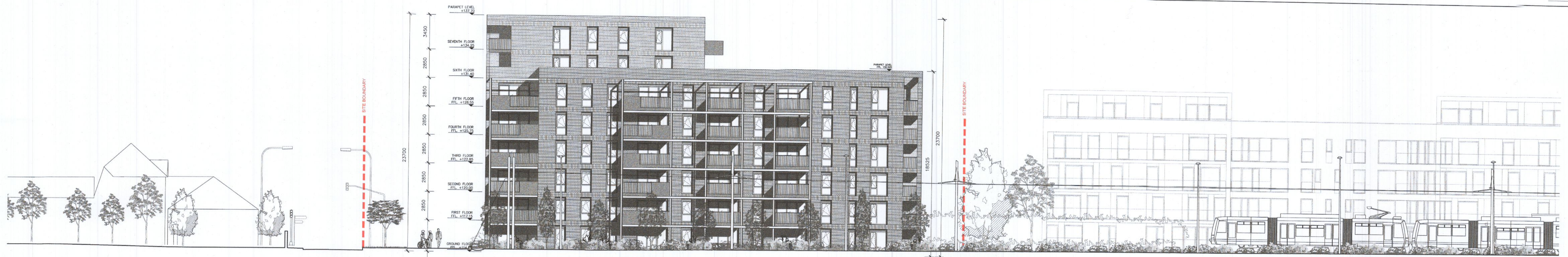
01 Permitted Contextual South Elevation - No amendments Proposed EX 302 1:200