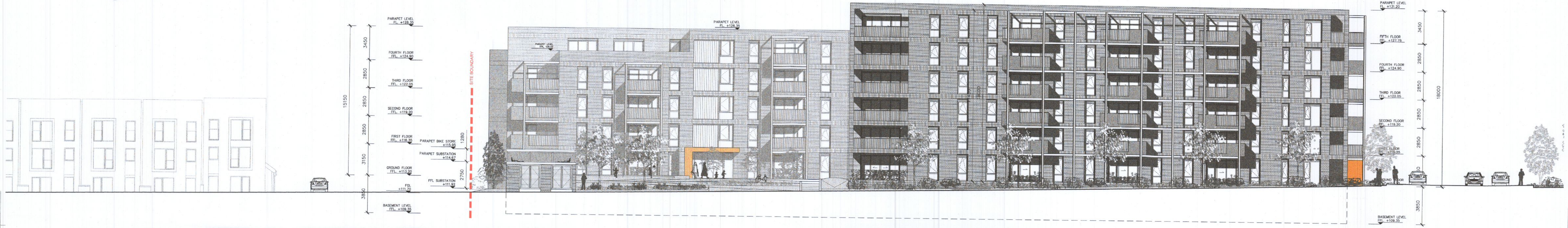
02 Permitted Contextual West Elevation 01 - No amendments Proposed EX 302 1:200