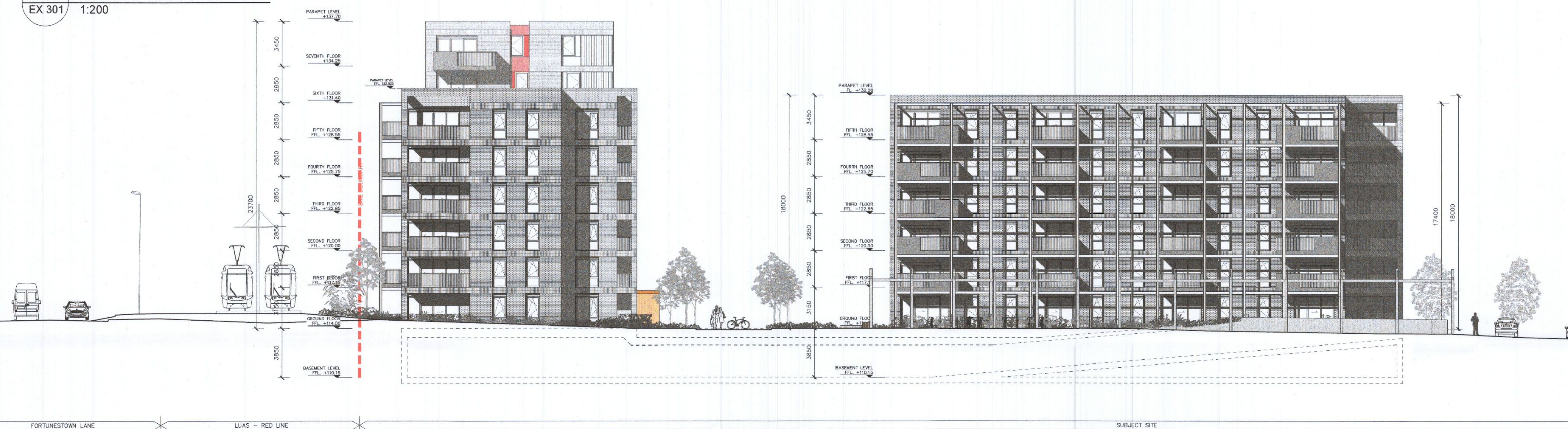
02 Permitted Contextual East Elevation 01 EX 301 1:200