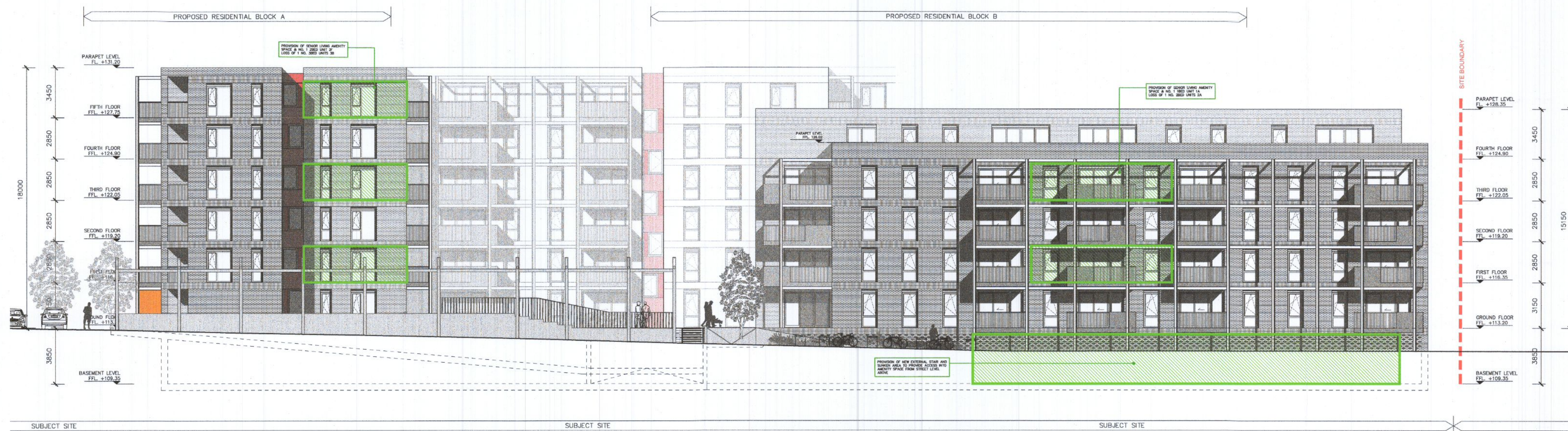
03 Permitted Contextual East Elevation 02 EX 301 1:200

ISSUED FOR PLANNING ONLY, NOT FOR CONSTRUCTION