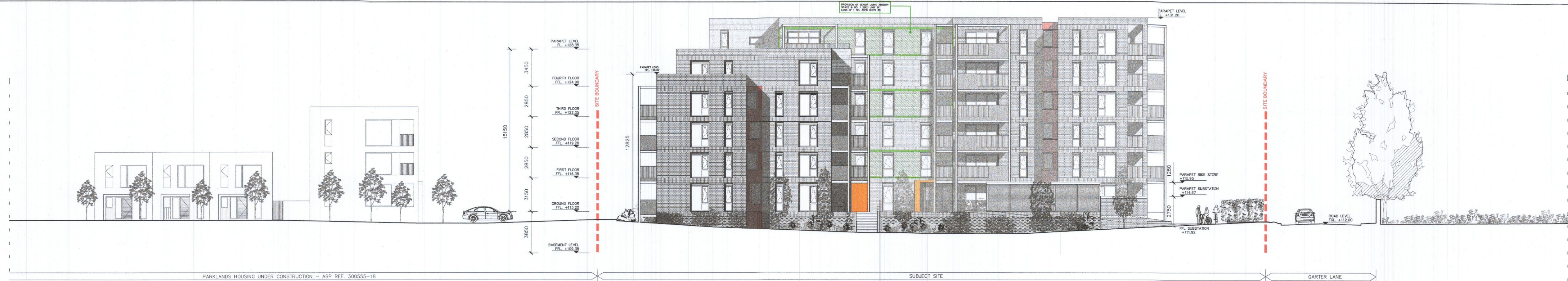
01 Permitted Contextual North Elevation EX 301 1:200