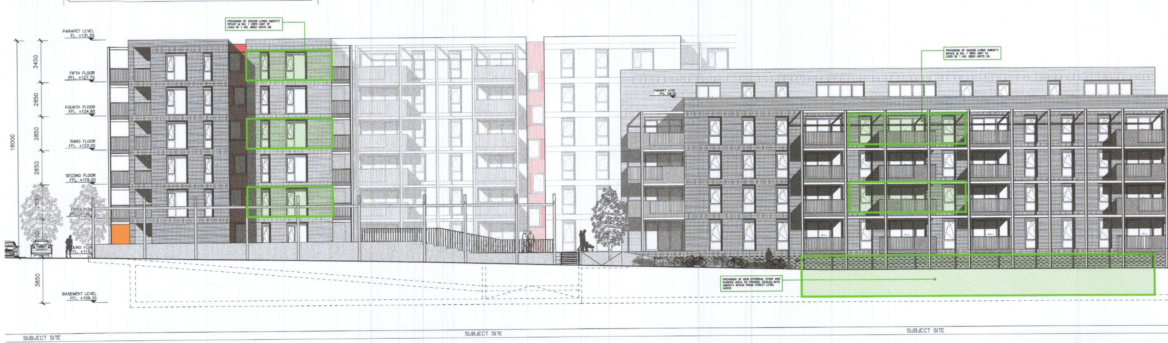
03 Permitted Contextual East Elevation 02 EX 301 1:200

ISSUED FOR PLANNING ONLY, NOT FOR CONSTRUCTION