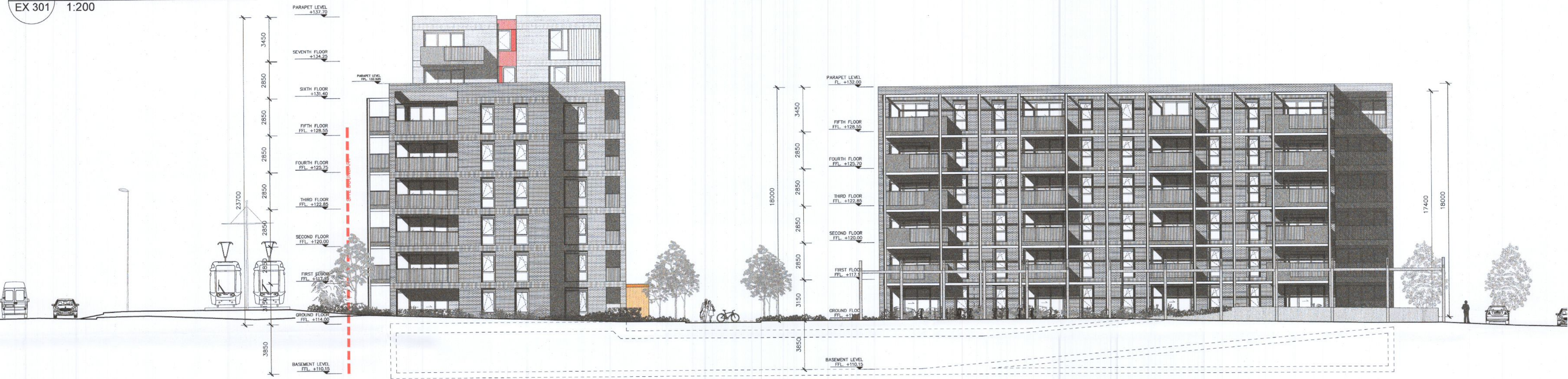
02 Permitted Contextual East Elevation 01 EX 301 1:200