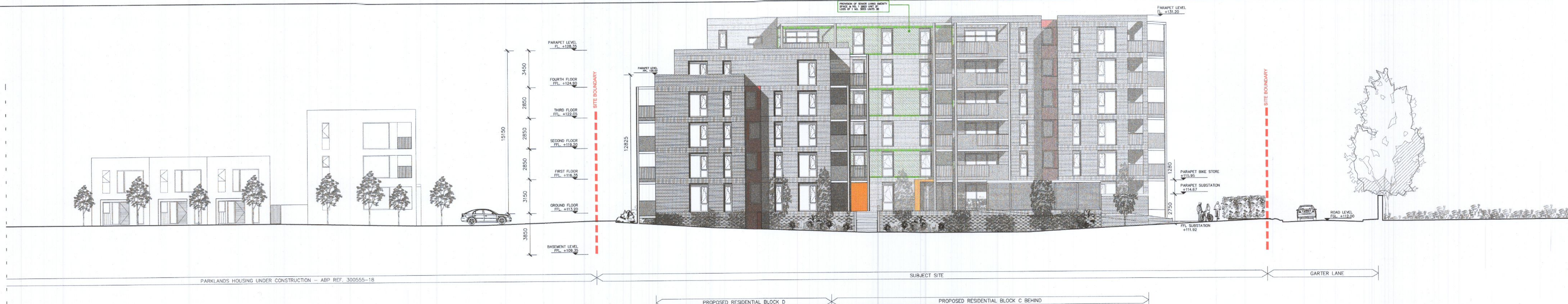
01 Permitted Contextual North Elevation EX 301 1:200