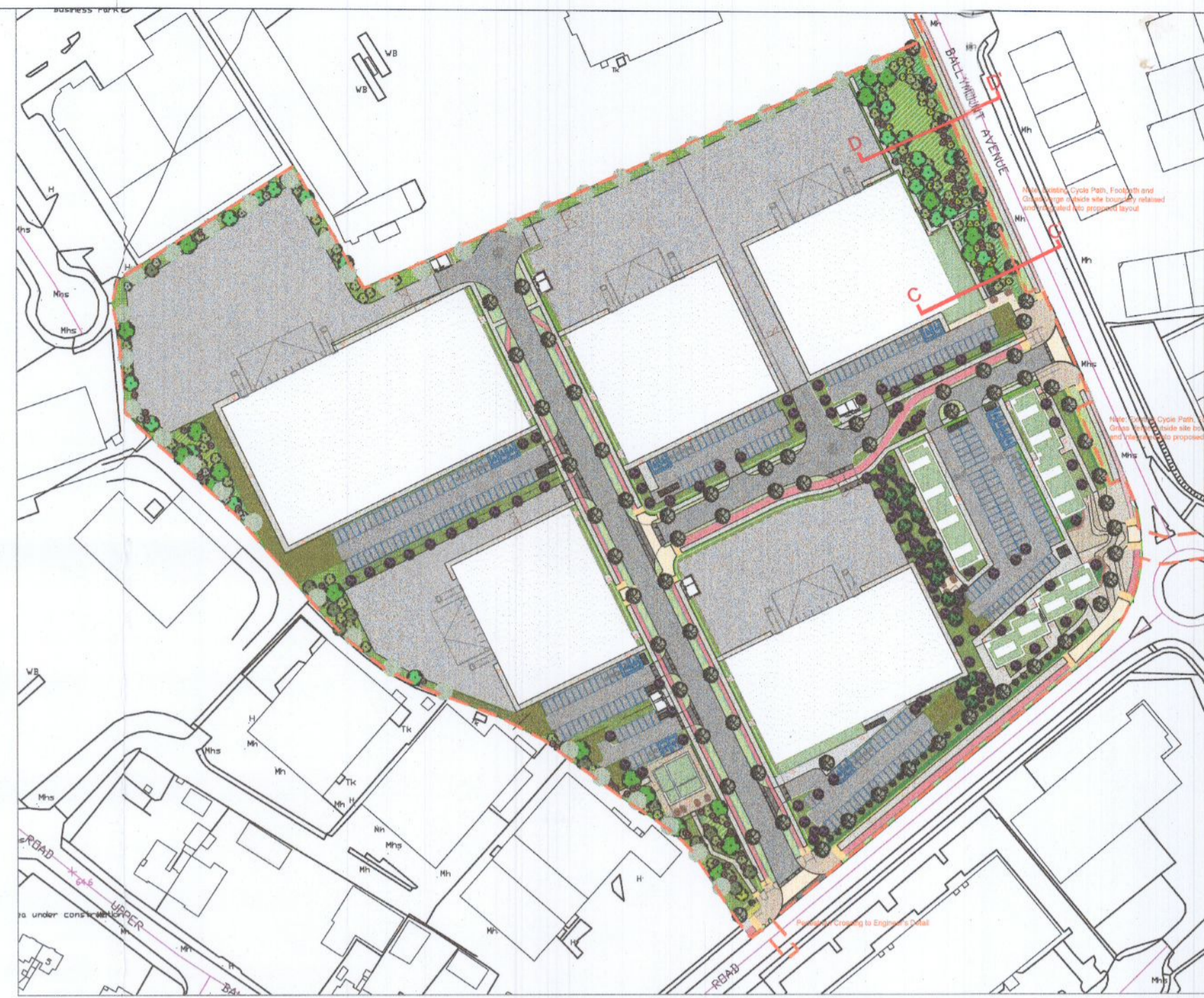
Key Plan 1:2000