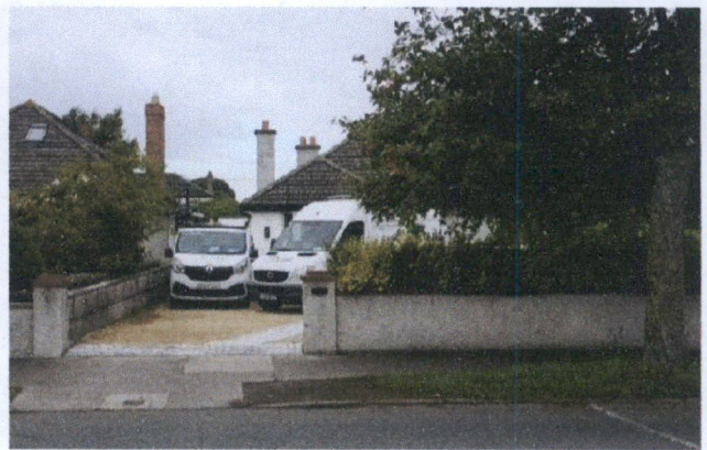
EXISTING FRONT DRIVEWAY & ENTRANCE