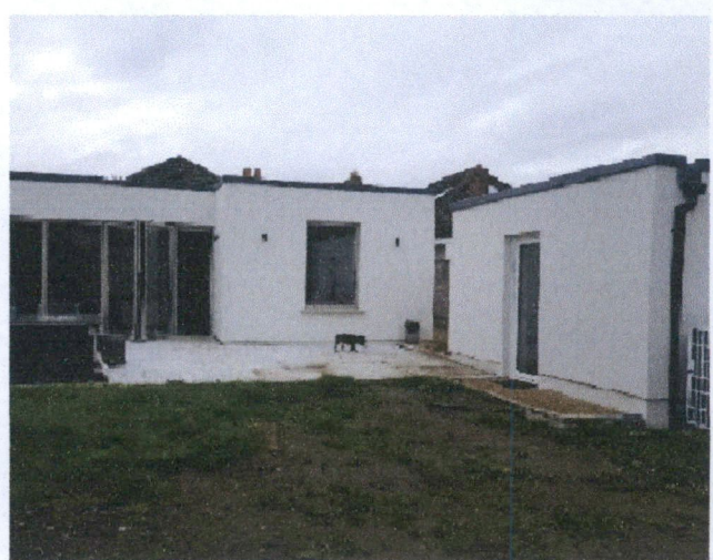
EXISTING REAR GARDEN