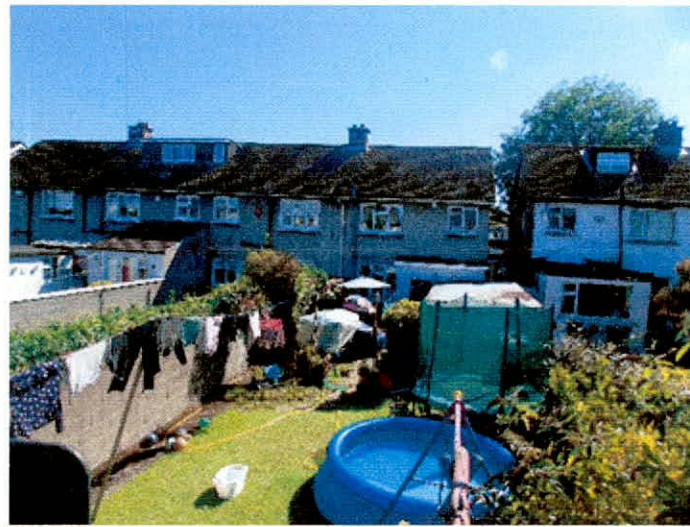
DRAWING : EXISTING REAR NORTH ELEVATION