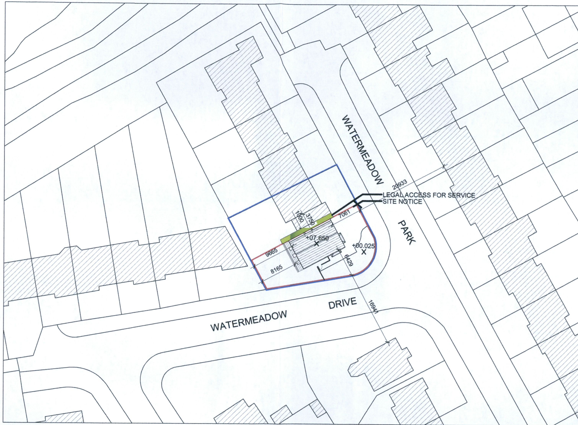
SITE PLAN Scale: 1:500