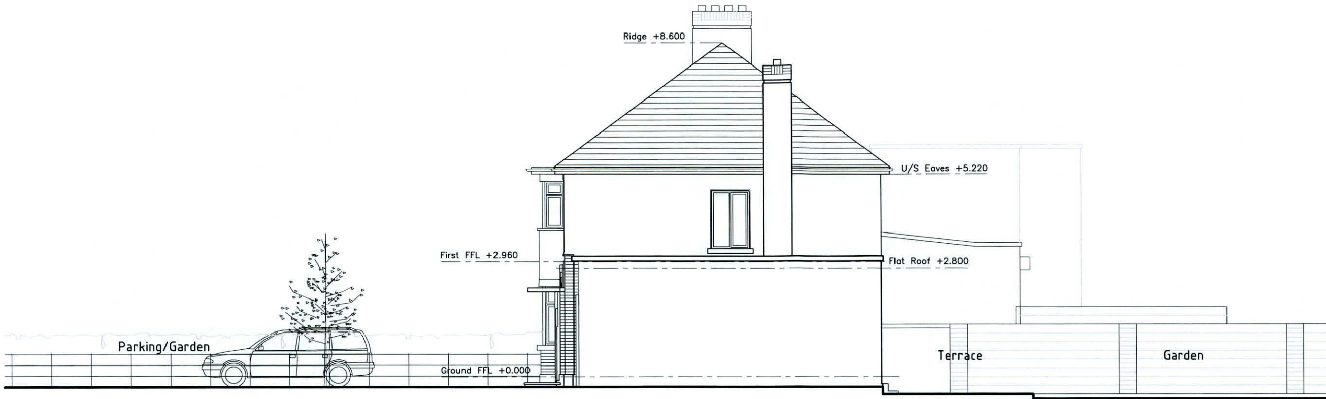
Side (West) Elevation