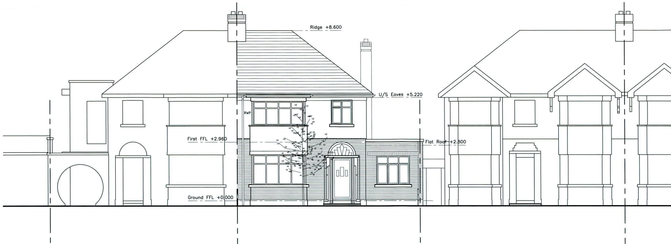
Front (North) Contiguous Elevation