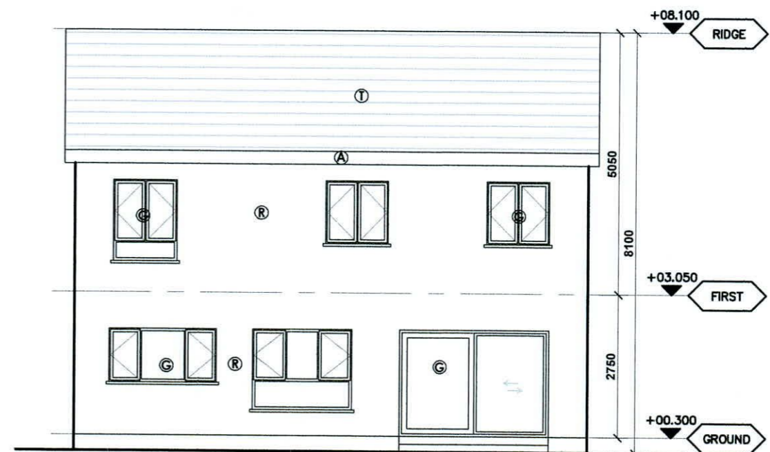
Proposed Rear Elevation Scale - 1:100

Project Title: Proposed first floor extension to front/side, internal alterations and refurbishments including roof light to front of existing dwelling all at 85 Templeogue wood, Dublin 6W