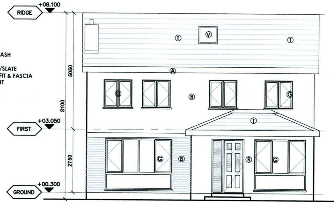
Proposed Front Elevation Scale - 1:100