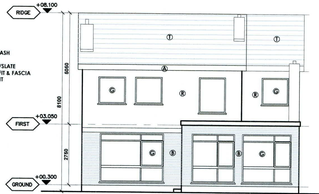
Existing Front Elevation Scale - 1:100