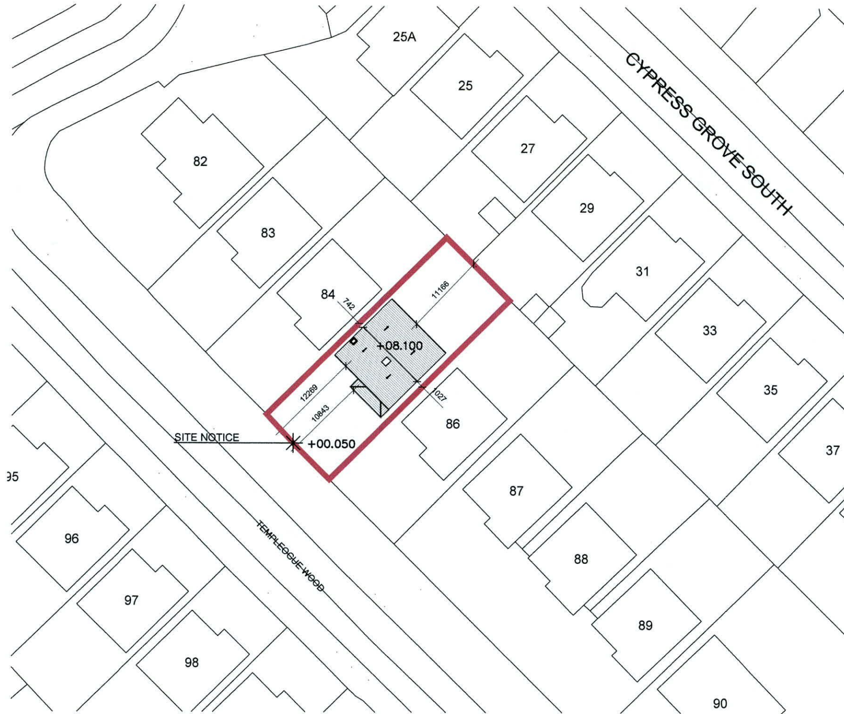
Site Plan Scale - 1:500