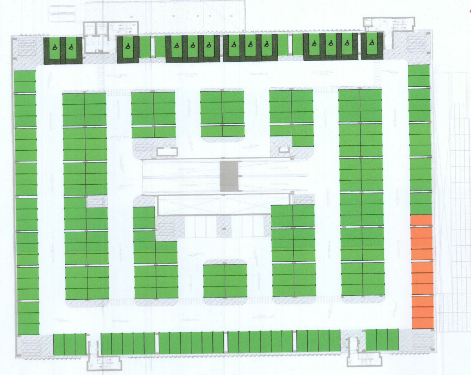
PARKING LEVEL 2 214 SPACES - NON- RESIDENTIAL 10 SPACES - HEALTH CENTRE