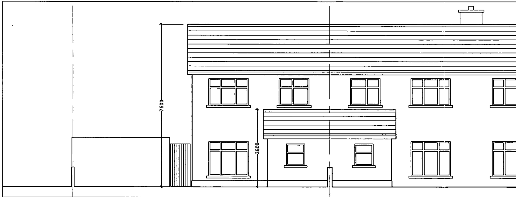
EXISTING SOUTH-WEST ELEVATION Scale 1:100