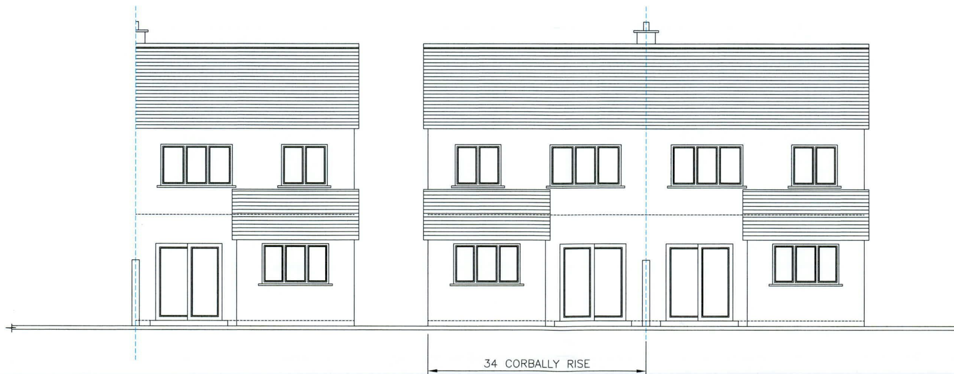
EXISTING REAR ELEVATION - CONTIGUOUS