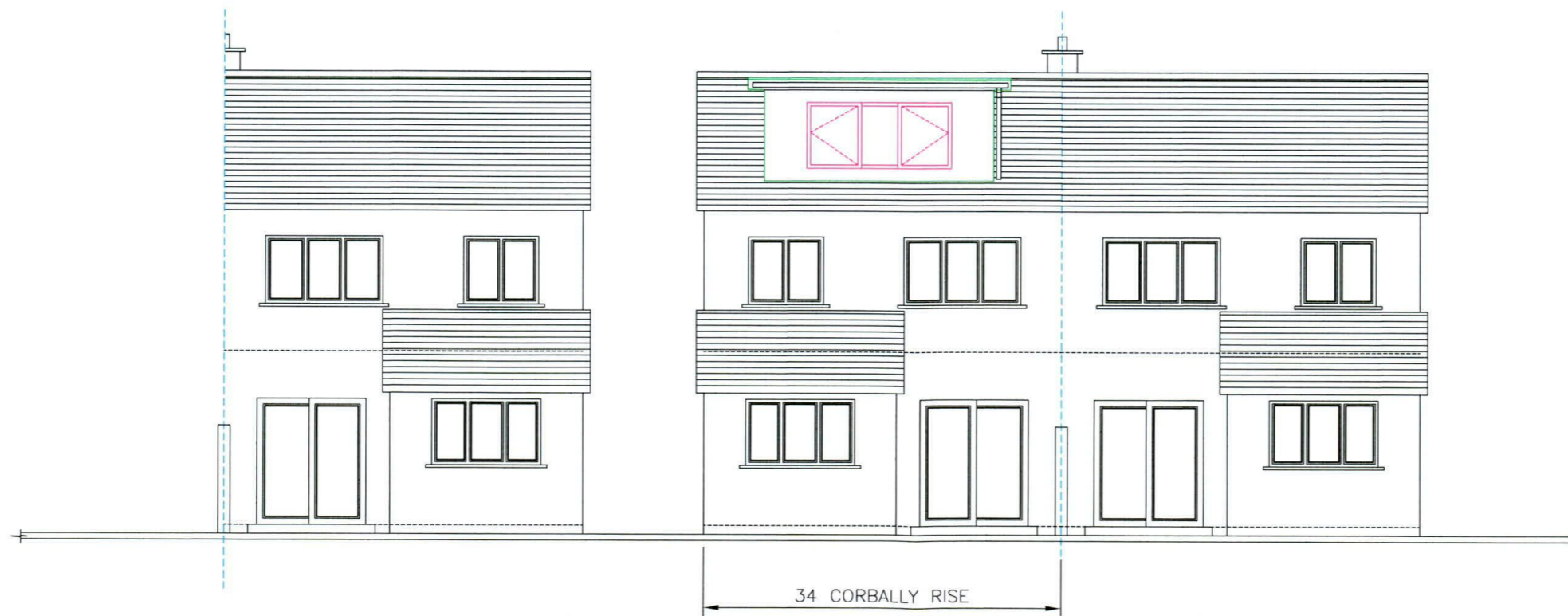
PROPOSED REAR ELEVATION - CONTIGUOUS