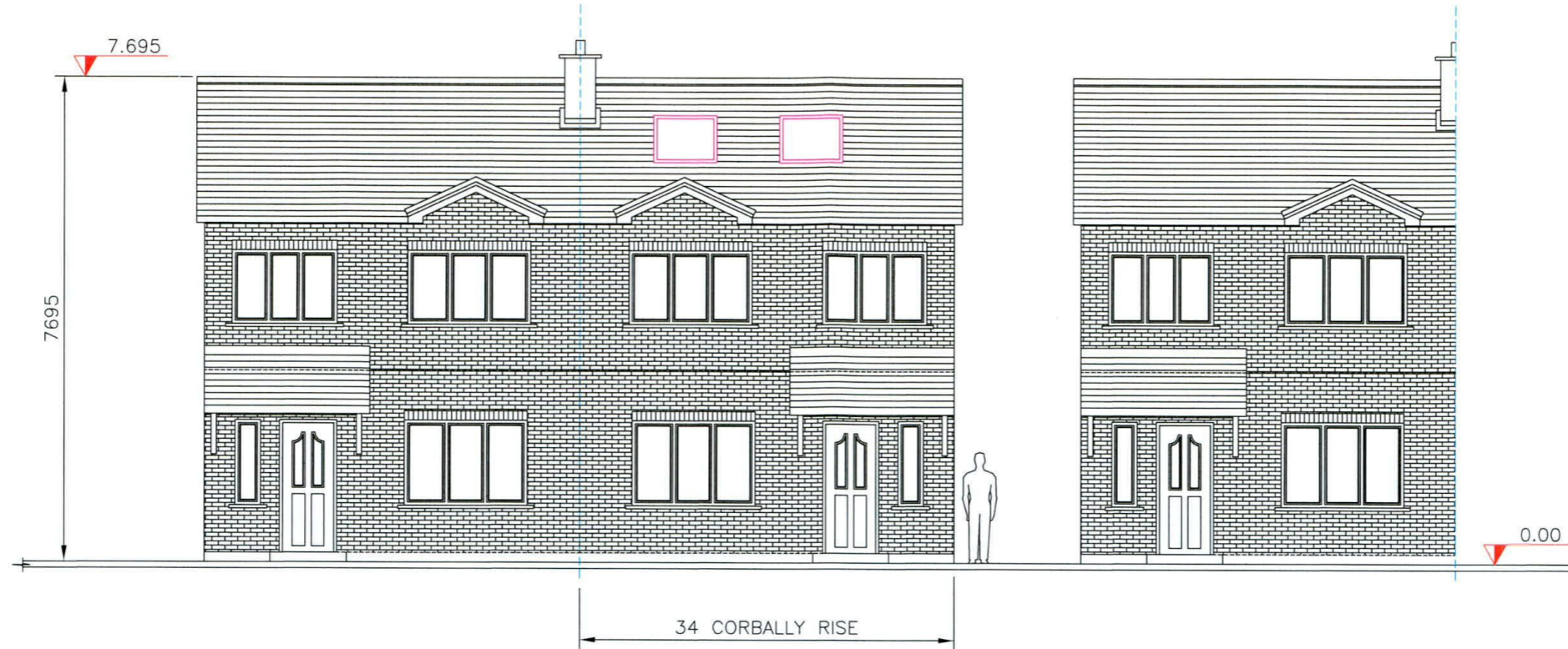
PROPOSED FRONT ELEVATION - CONTIGUOUS