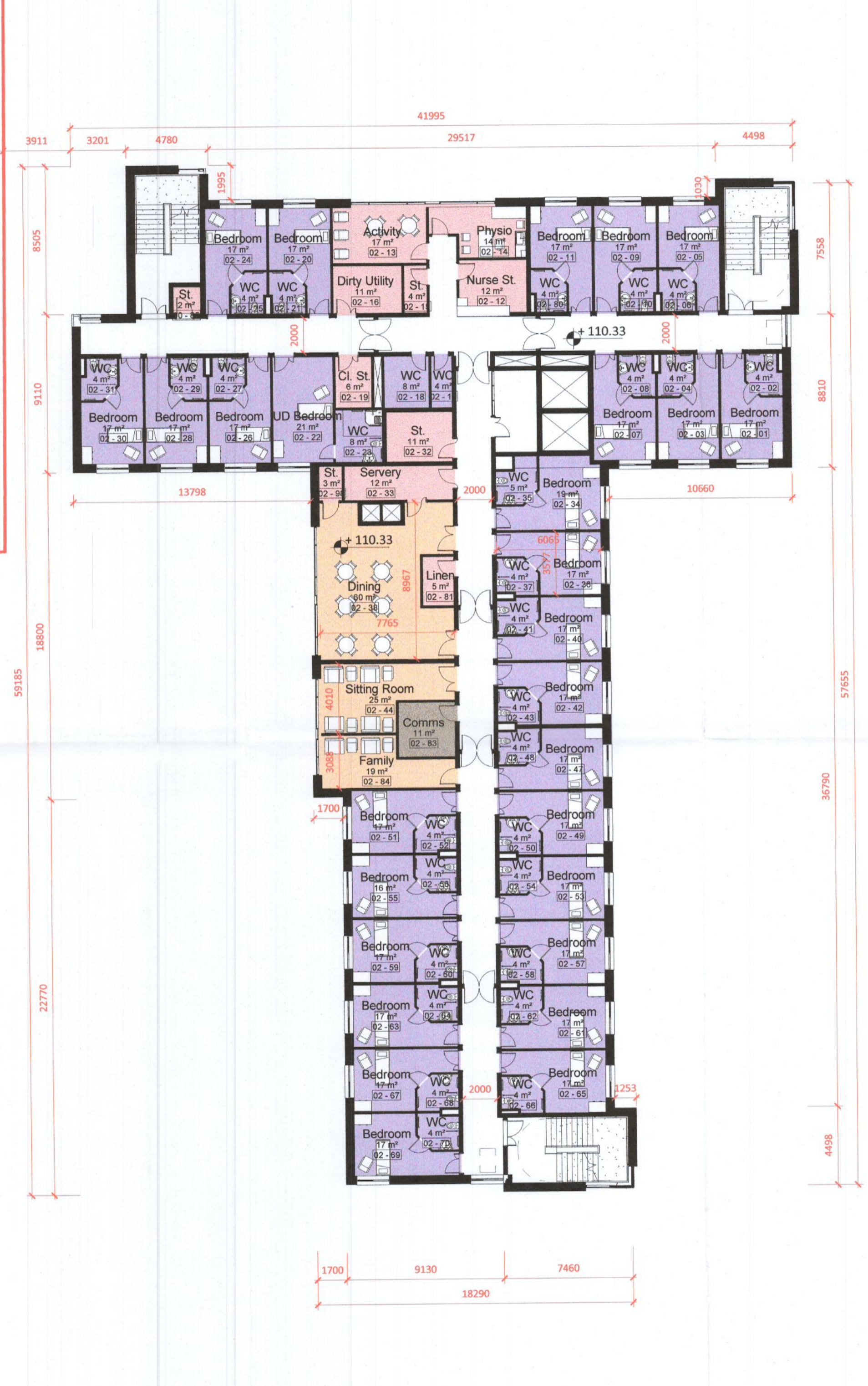
2 02 - Second Floor Level 1:200