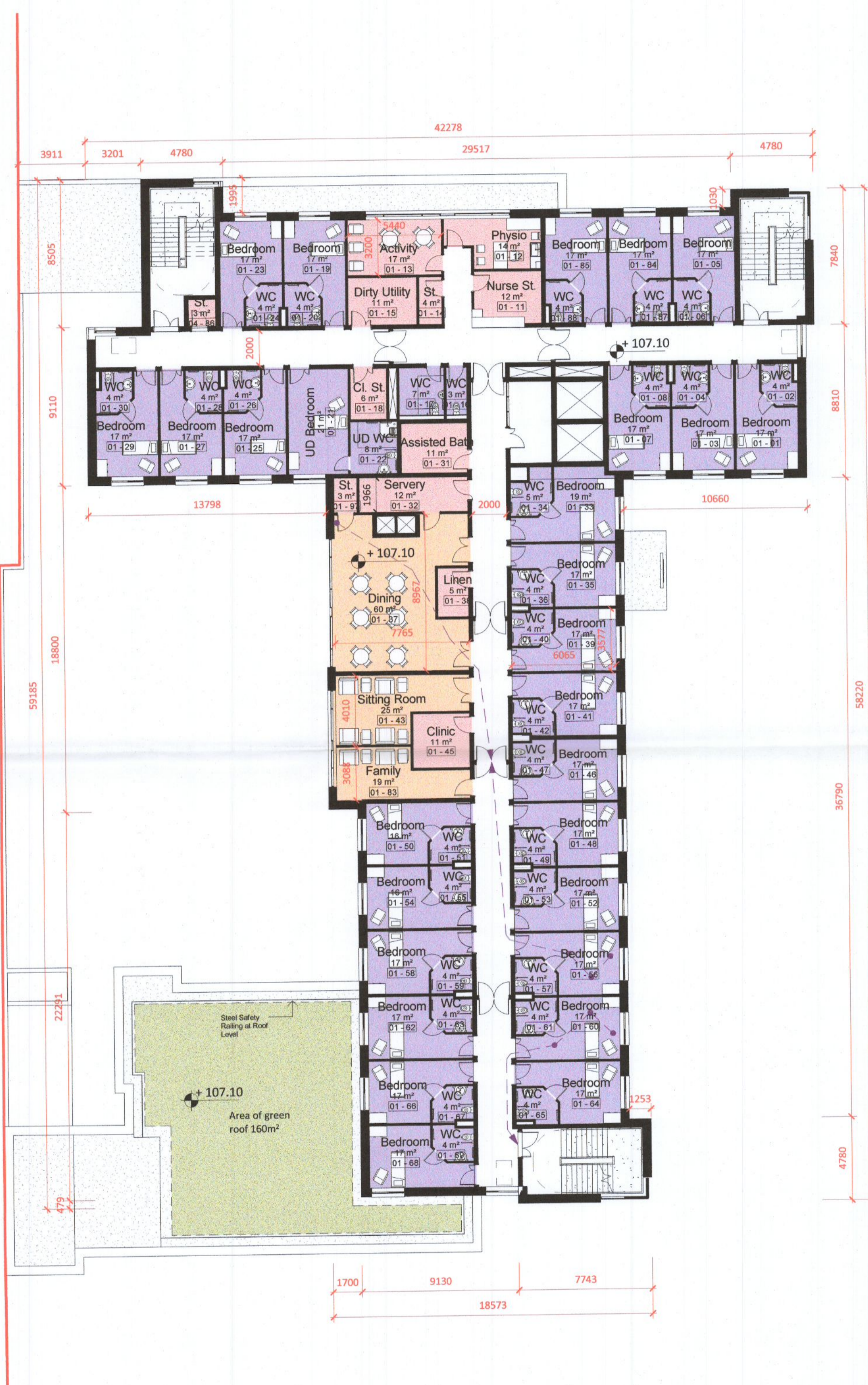
1 01 - First Floor Level 1:200