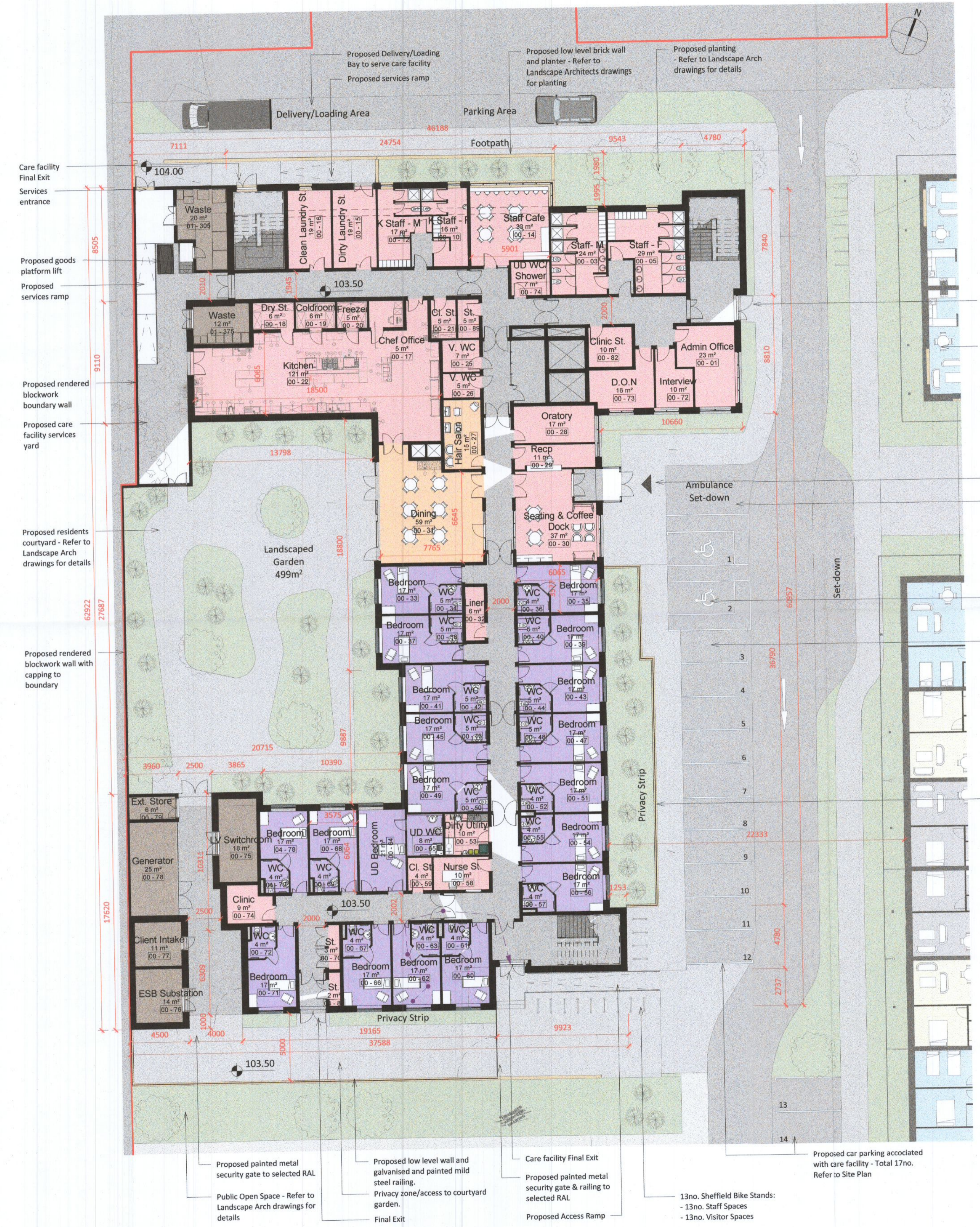
2 00 - Ground Floor Level 1:200