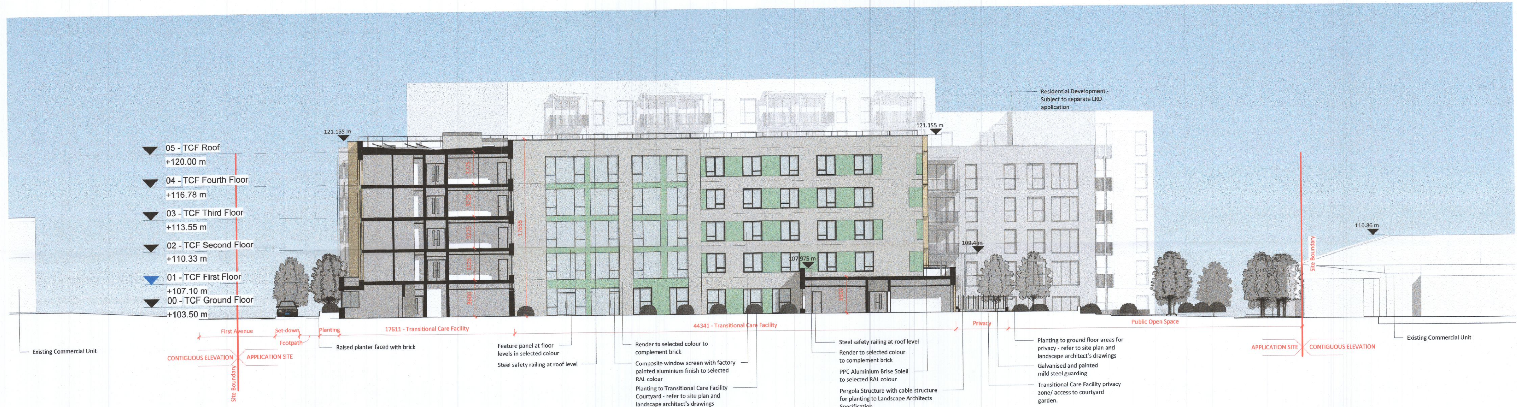
1 Proposed Section E-E - Transitional Care Facility 1:200

GENERAL NOTES: A. THIS DRAWING IS TO BE READ IN CONJUNCTION WITH ALL RELEVANT ARCHITECTURAL DRAWINGS, THE SPECIFICATION, AND ALL RELEVANT STANDARD DETAIL DRAWINGS. B. THIS DRAWING IS TO BE READ IN CONJUNCTION WITH ALL RELEVANT CIVIL, STRUCTURAL, MECHANICAL AND ELECTRICAL DRAWINGS TOGETHER WITH THE SPECIFICATIONS AND SCHEDULES. C. ALL DIMENSIONS IN MILLIMETRES. DO NOT SCALE FROM THIS DRAWING. USE FIGURED DIMENSIONS ONLY. D. CONTRACTOR MUST VERIFY ALL DIMENSIONS ON SITE BEFORE SETTING OUT, COMMENCING WORK, OR PRODUCING ANY SHOP DRAWINGS.