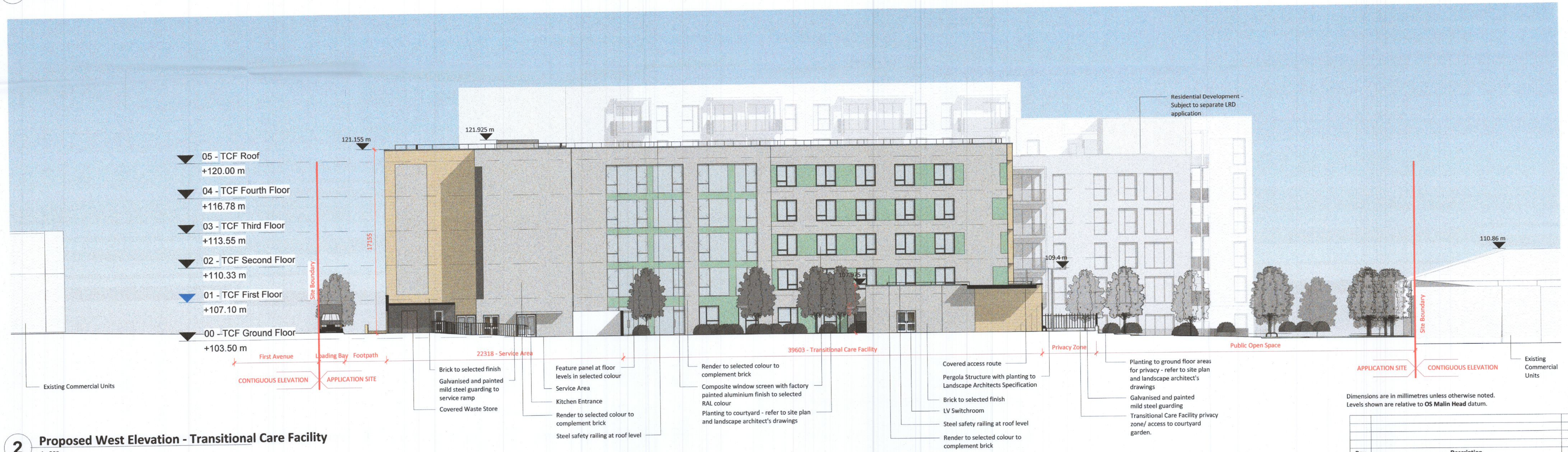
2 Proposed West Elevation - Transitional Care Facility 1:200