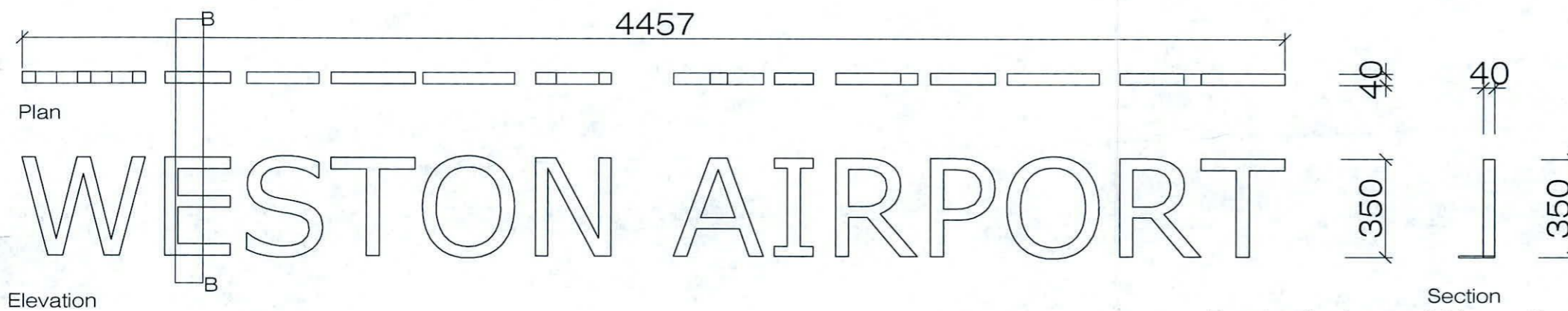
Weston Airport Main Sign Plan/section/elevation 2 111 1:20

Freestanding bronze finish metal lettering on walkway canopy.