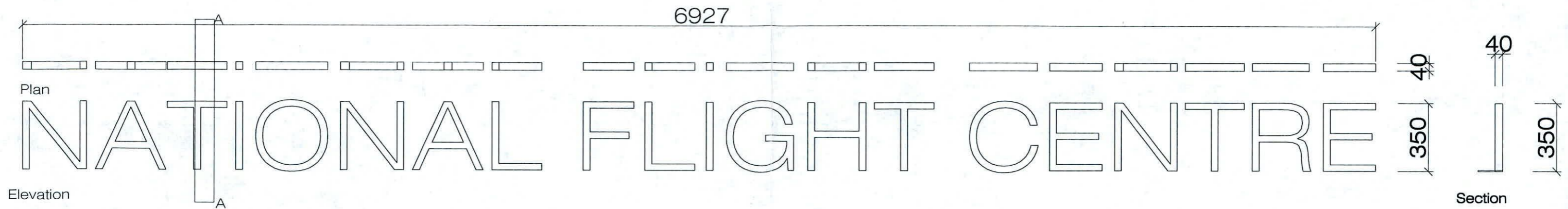
National Flight Centre Sign Plan/section/elevation 1 111 1:20

Freestanding bronze finish metal lettering on walkway canopy.