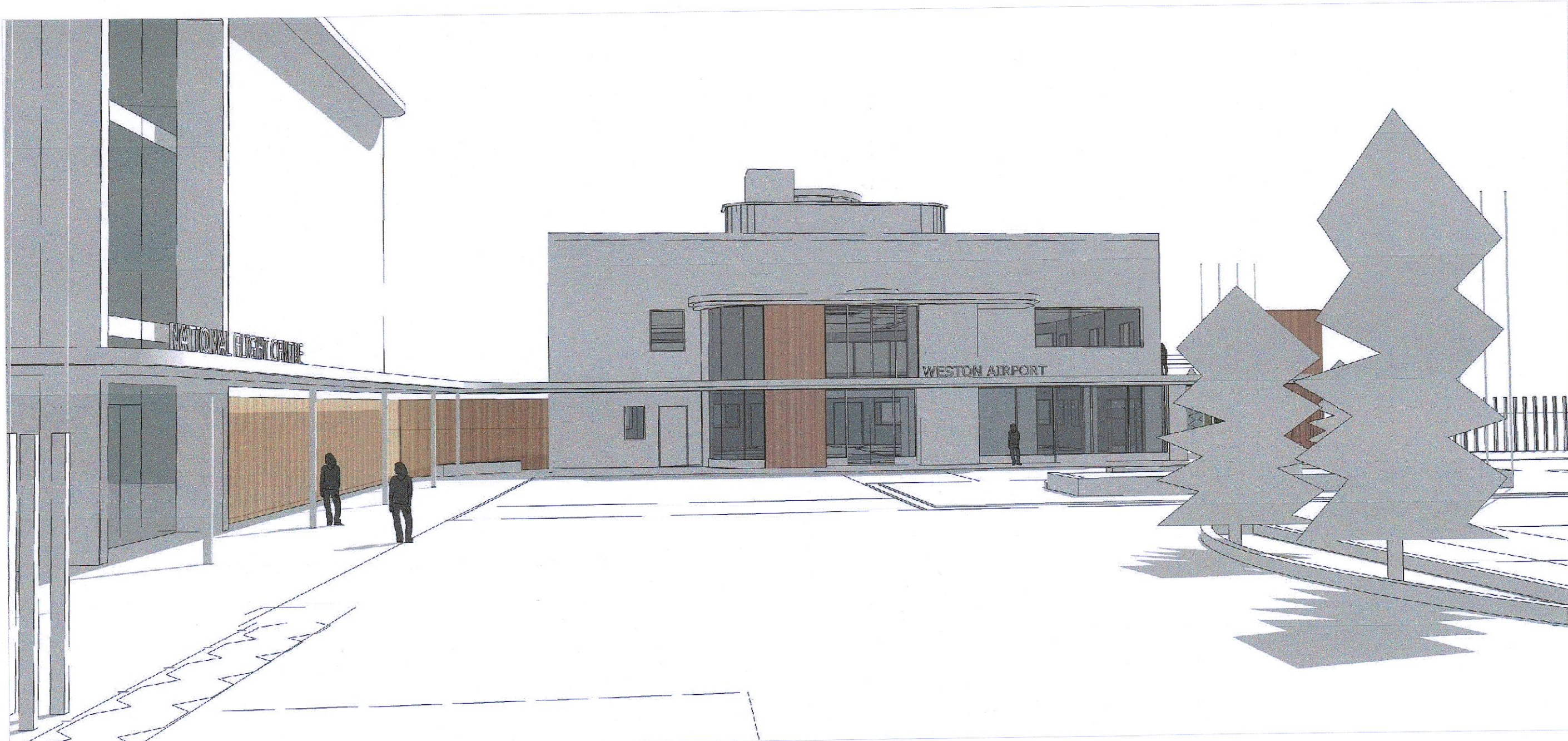
Face On Image from Carpark nrs