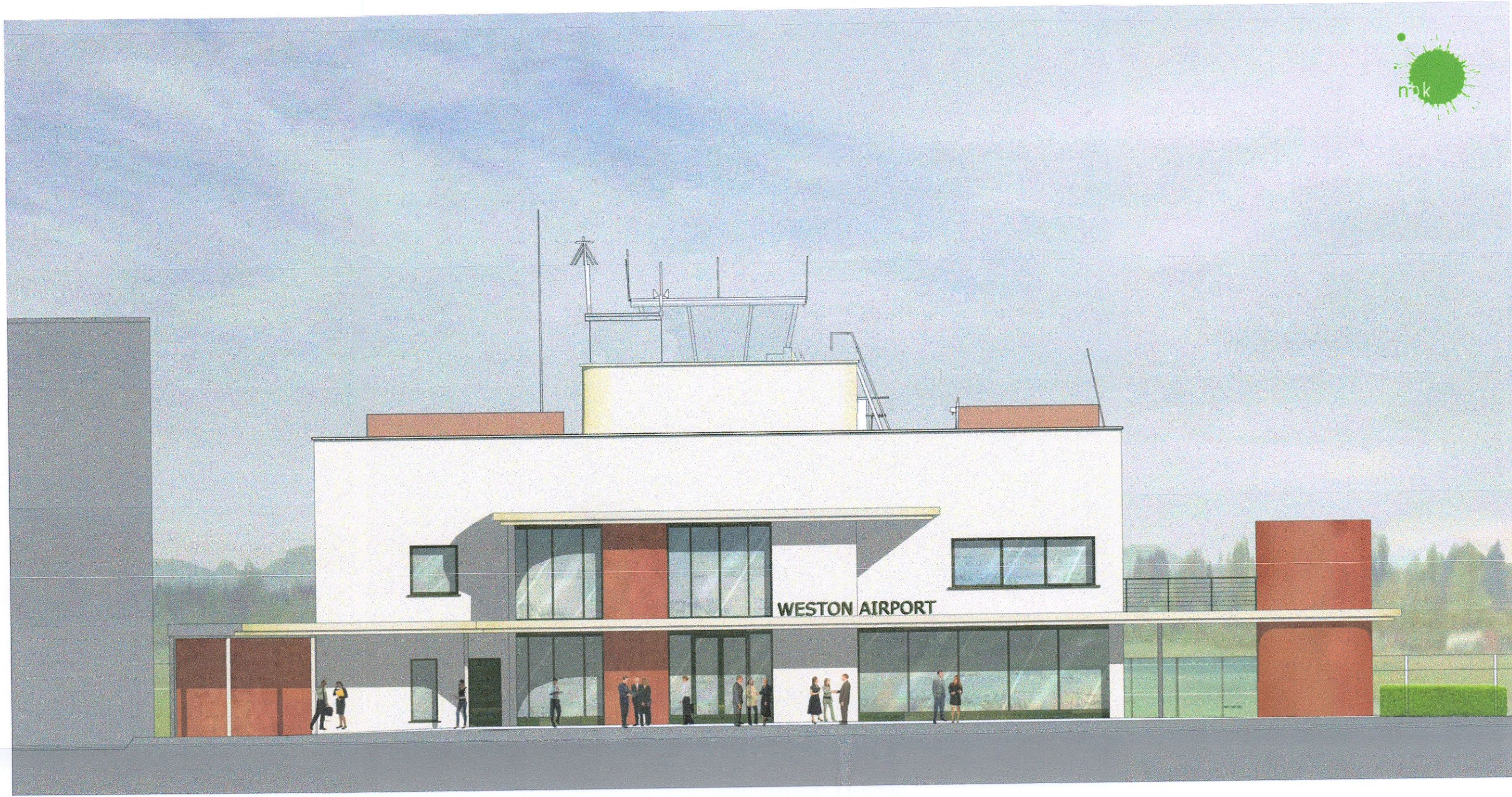
Coloured Landside Elevation nrs