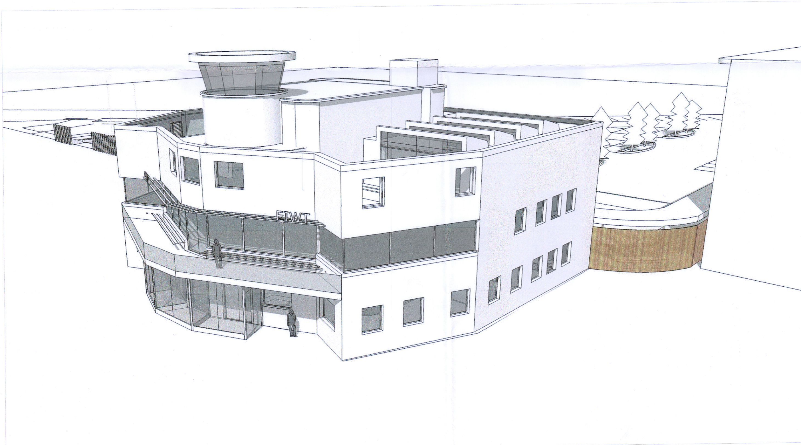
Aerial View of Proposal (Airside) nrs