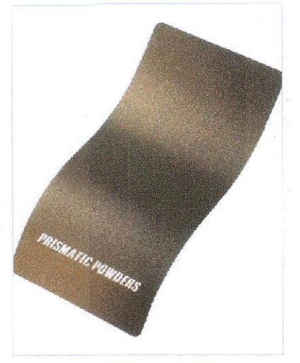
Bronze Powdercoating for Aluminium framed glazing (Oil Rubbed Bronze Satin: 21-35 Gloss Units) Syntha Pulvin XDKB 018 or similar