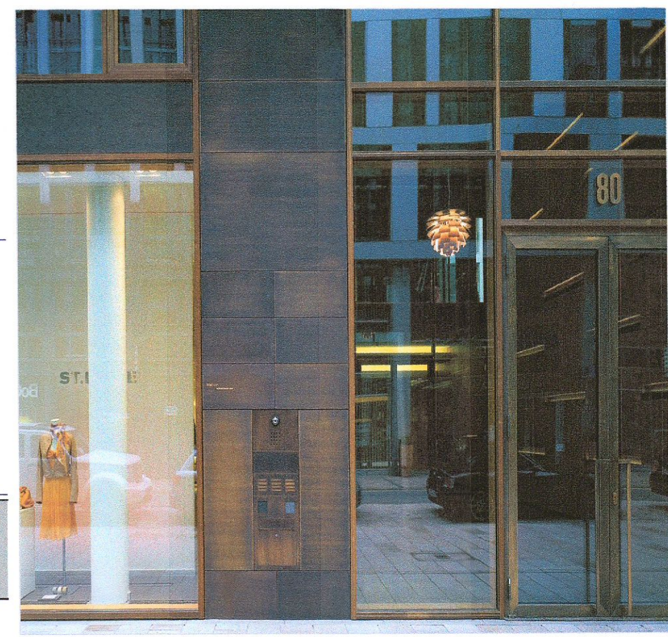
Sample Image: Bronze framed glazing for new foyer