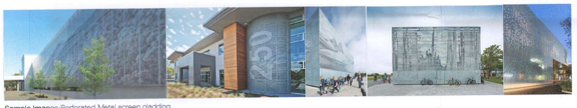
Sample Images: Perforated Metal screen cladding