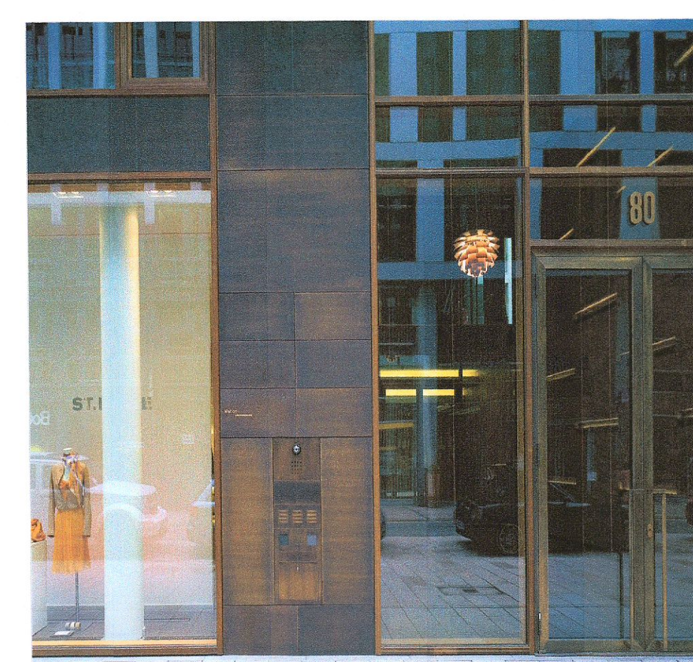
Sample Image: Bronze framed glazing for new foyer