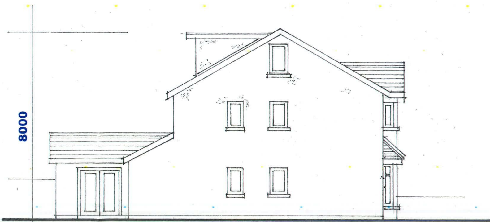
side elevation 1:100.

mhm design.086.8464108. architectural and planning consultants, clearview, ballykea road, loughshinny, skerries, co dublin.