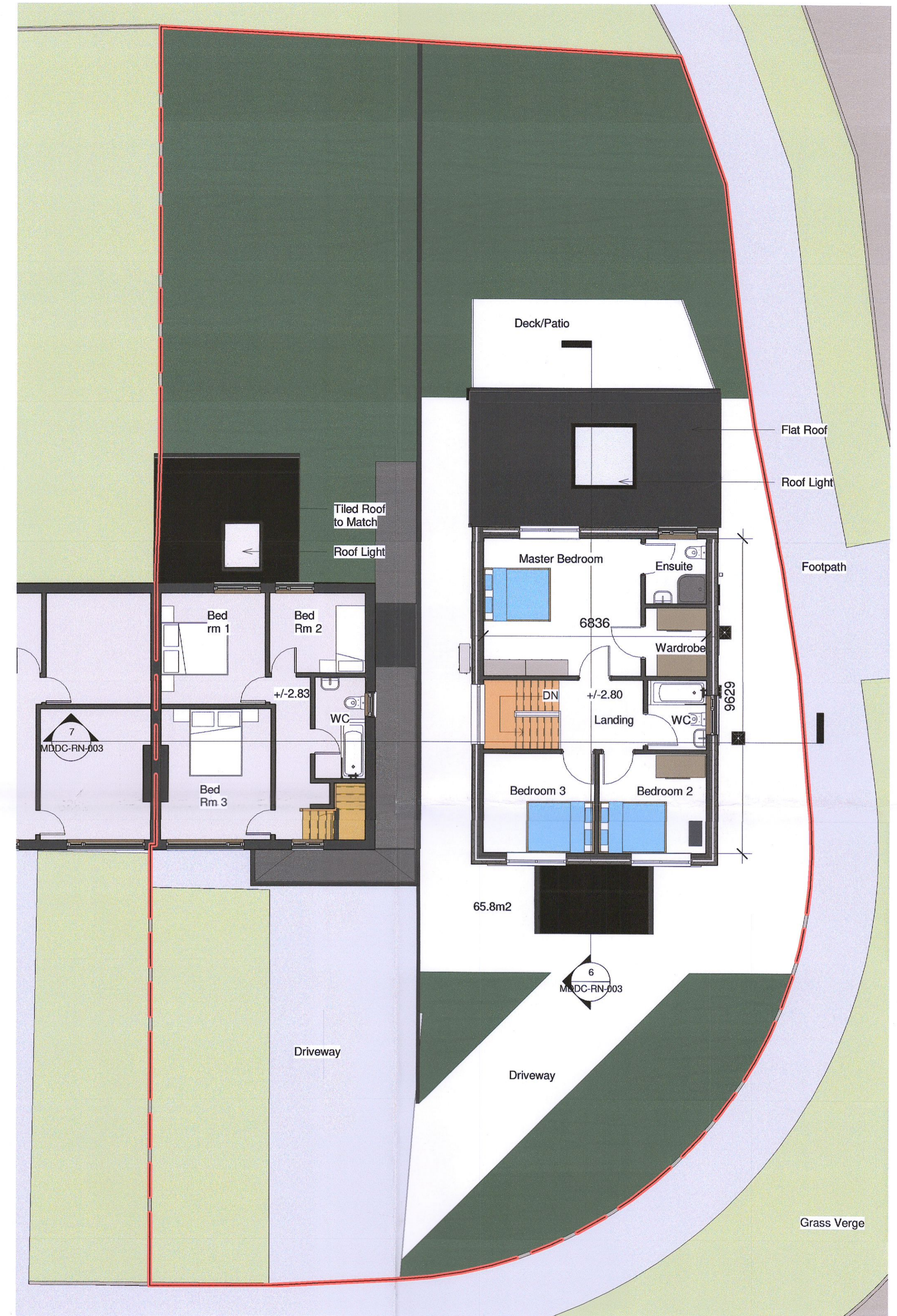
2 New 1st Floor 1 : 100