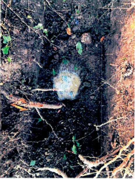
T - Tests & Trial Pit