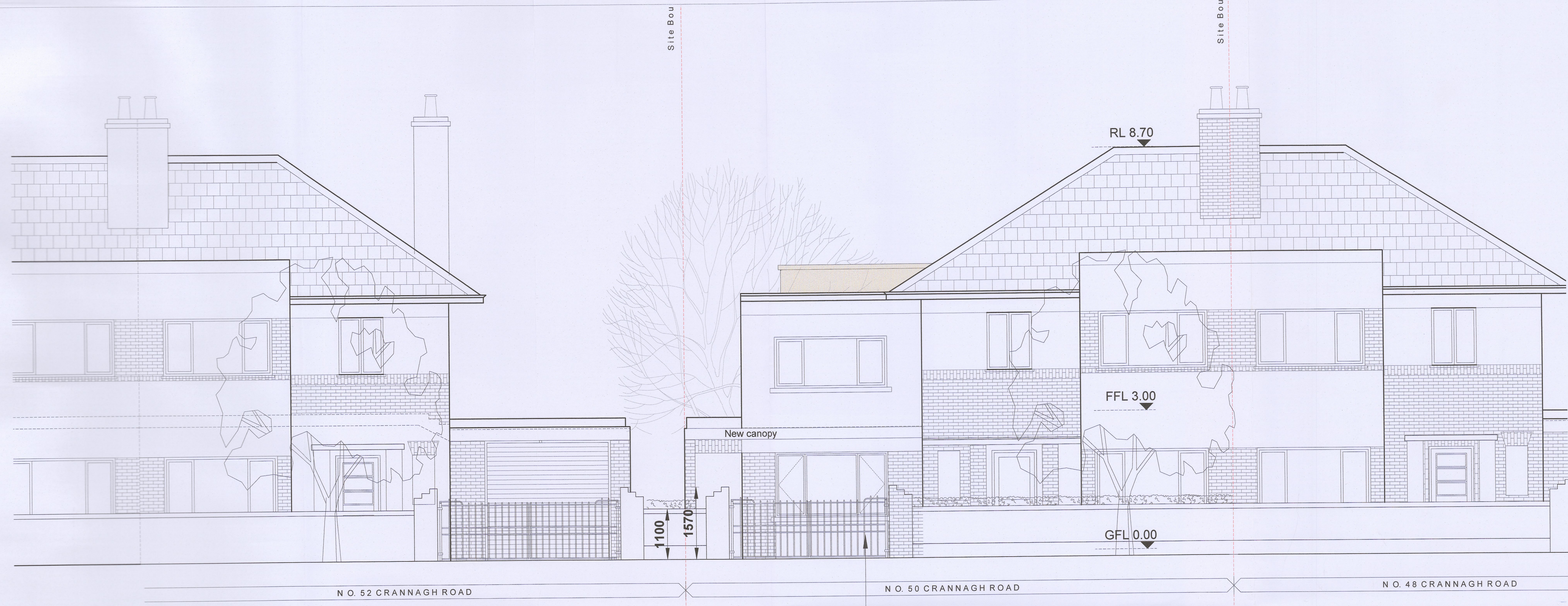
Proposed Street Elevation Scale 1:50 @ A1