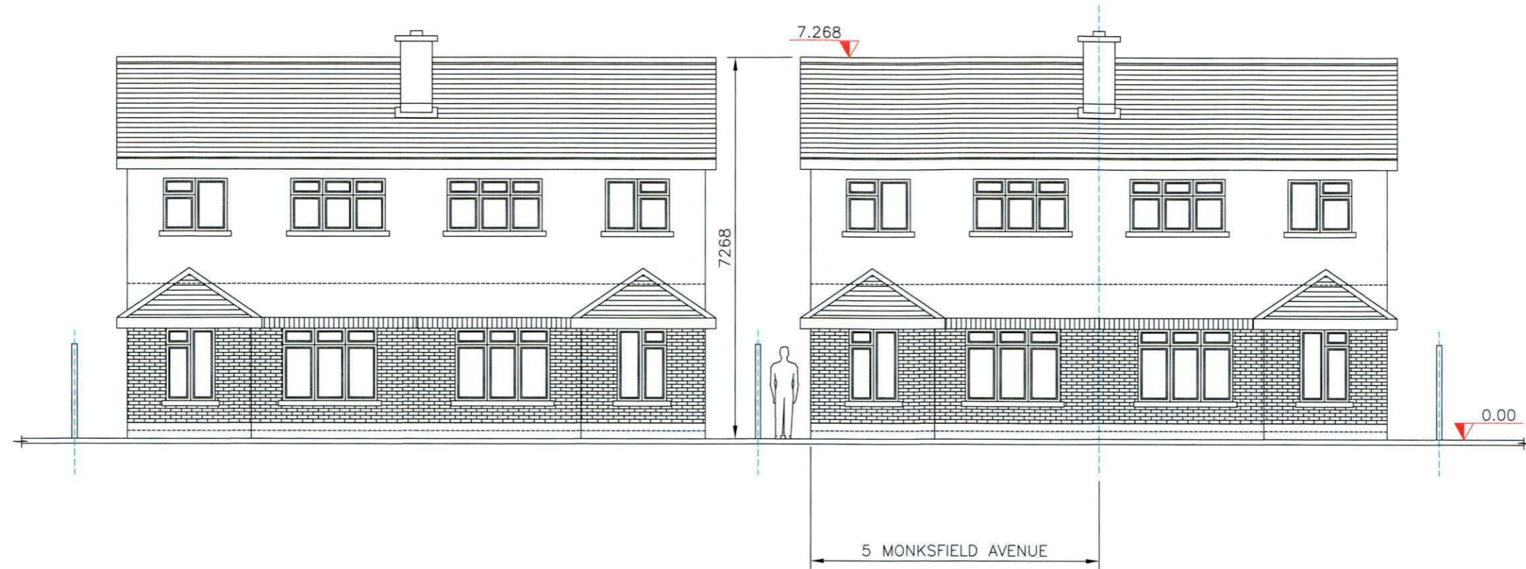
EXISTING FRONT ELEVATION - CONTIGUOUS