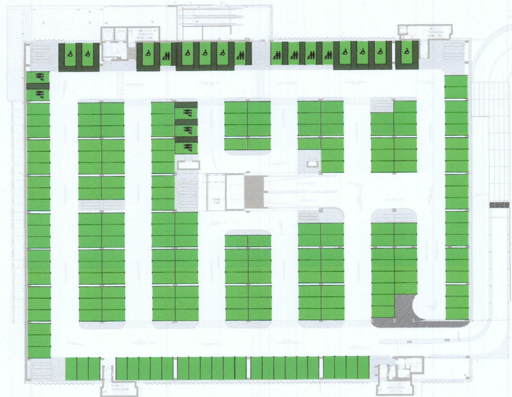
PARKING LEVEL 1