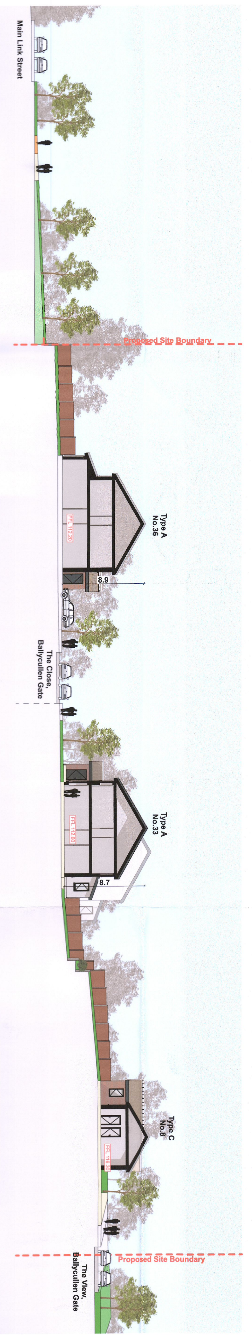
Proposed Site Elevation 04 SCALE: 1:500