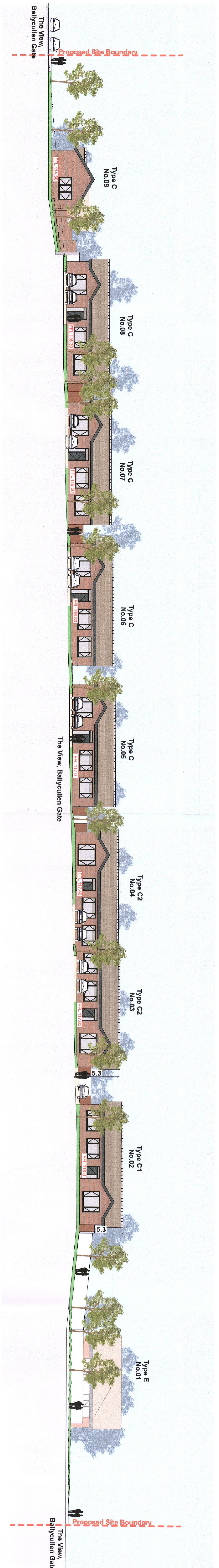
Proposed Site Elevation 01 SCALE: 1:500