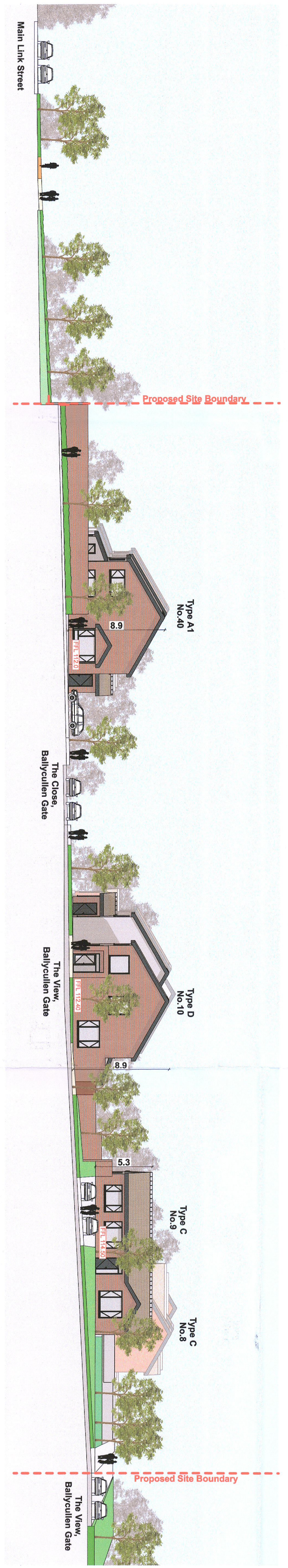
Proposed Site Elevation 02 SCALE: 1:500