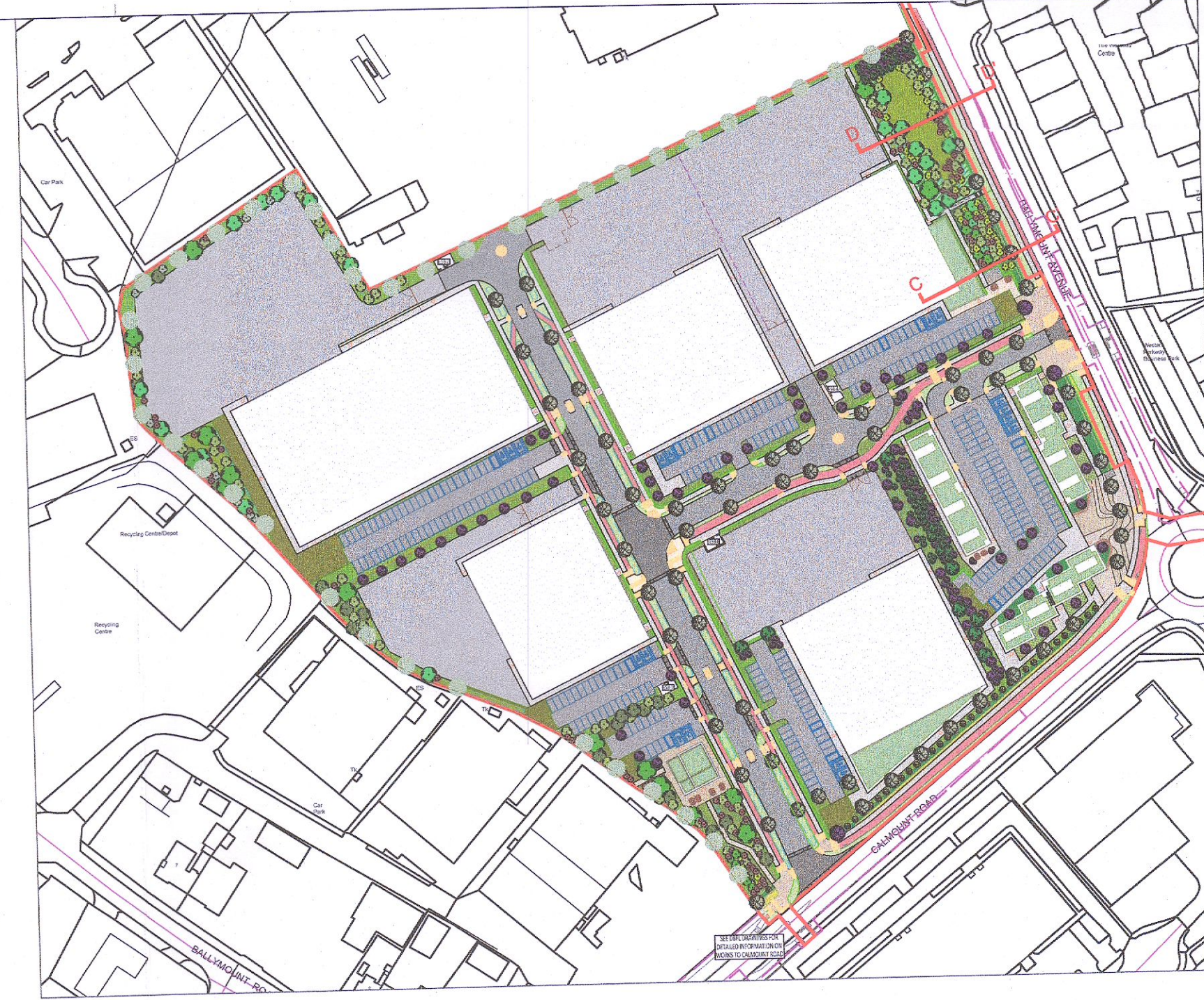
Key Plan 1:2000